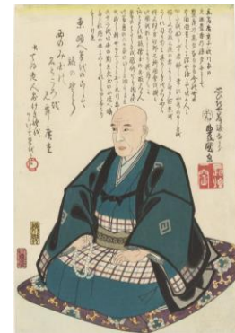
Utagawa Toyokuni III / Memorial Portrait of Utagawa Hiroshige Collection of Shizuoka City Tokaido Hiroshige Museum of Art

He became a pupil of Toyohiro Utagawa when he was about 15 years old. His work Fifty Three Station of the Tōkaidō (Tōkaidō Hoeidō Edition) caused a great sensation, after that he continued to create Ukiyo-e prints about the Tōkaidō and the landscape of Edo and became famous as landscape artist. While he was working on what is considered his late-life masterpiece, One Hundred Famous Views of Edo , Hiroshige fell ill and passed away at the age of 62. Hiroshige's bold composition and lyrical style is loved by all and his works continue to influence artists all over the world.