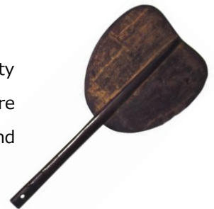
Right / Part 2 Gunbai-uchiwa (Military Leader's Fan) Collection of Shizuoka Sengen Shrine

Also on display are items related to the Tokugawa family from historic sites in Shizuoka city – Seiken Temple in Okitsu where Ieyasu studied as a child, Shizuoka Sengen Shrine where Ieyasu prayed for victory in the Sengoku period (Warring States period, 1467–1603), and Rinkō temple in Yui where Ieyasu visited while practicing falconry.