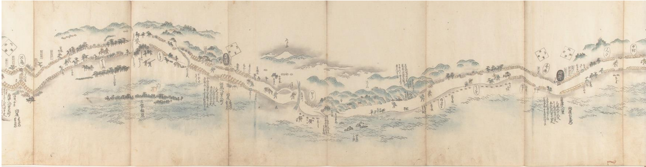
Above / Part 2 Utagawa Hiroshige