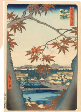
Part1 Utagawa Hiroshige One Hundred Famous Views of Edo "Maple Trees at Mama, Tekona Shrine and Tsugihashi Bridge" Museum Collection