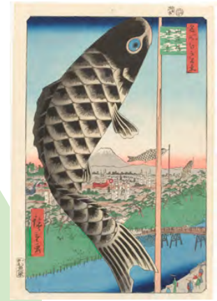
Part2 Utagawa Hiroshige One Hundred Famous Views of Edo "Suidōbashi Bridge and Surugadai" Museum Collection