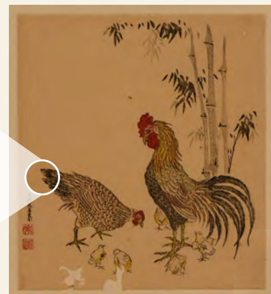
Collection of DASOKUAN