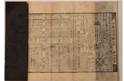
Ise goyomi Calendar of 1826 Dasokuan Collection

As there are approximately 29.5 days in the Moon's period of revolution around the Earth, the lunar calendar which is based on the monthly cycles of moon phases has a short month in which a month is 29 days and a long month that is 30 days. This exhibition will introduce the "Dai-shō" concept so the combinations of long ( Dai ) and short ( Shō ) months can be easily remembered.