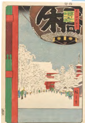
Part2 Utagawa Hiroshige One Hundred Famous Views of Edo "Kinryūzan Temple in Asakusa" Museum Collection