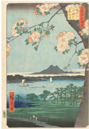
Part1 Utagawa Hiroshige One Hundred Famous Views of Edo "Suijin Shrine and Massaki on the Sumida River" Museum Collection

This exhibition will introduce the seasonal divisions used in the lunisolar calendar of the Edo period, as well as sceneries and social customs of the four seasons depicted in Ukiyo-e.