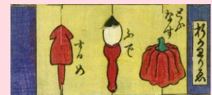
Work exhibited in Part 1. Artist Unknown “There is a funny thing in this” (detail) Private Collection