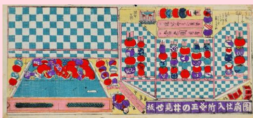
Work exhibited in Part 2. Artist Unknown “Kumiage-e: Fan Store” Private Collection

With connections to today's plastic models, Kumiage-e uses the cut-outs from Ukiyoe-Hanga to construct a 3-dimensional object.