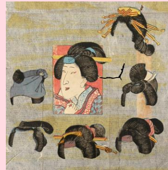
Work exhibited in Part 2. Artist Unknown “Bewigged” Private Collection

Katsuratsuke is type of Kisekae-e (changing clothes picture) where one can enjoy placing different character wigs on the image of an actor.