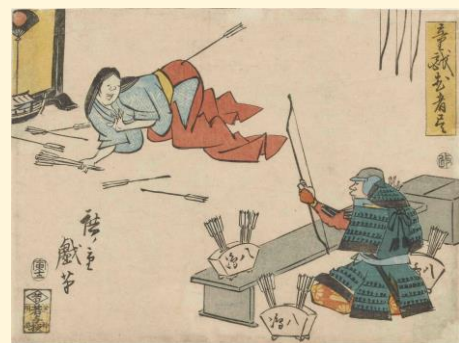
Work exhibited in Part 1. Utagawa Hiroshige A Collection of Warriors for the Amusement of Children “Nasu-no-Yoichi”

Giga is a comically drawn Ukiyo-e which presents a parody of real subject matter. The samurai Nasu-no-Yoichi is known for hitting the target of fan placed 70m away during Heike's Battle of Yashima. In this work, none of his arrows reach the target – they are scattered on the ground and one is stuck in the woman's backside.