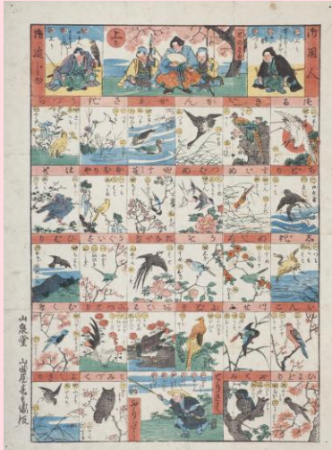
Work exhibited in Part 1. Utagawa Shigenobu “Newly Published: Bird Catcher Sugoroku” Private Collection

In Sugoroku , a player rolls dice in order to move along the board game. The work shown below features a variety of birds and the people who caught them professionally.