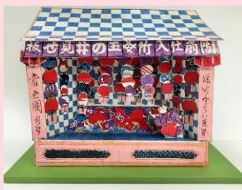
Completed Work (Replica)