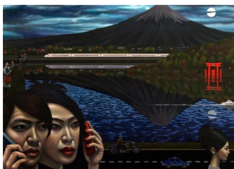
Tokaido Highway "Hakone" / © Carl Randall 2013

* The BP Travel Award is a general invitation exhibition which the National Portrait Gallery holds every year. The research expense of a work and the opportunity of an announcement are given to a winner. The National Portrait Gallery is an art museum that specifically collects a portrait works, and is an annex of the National Gallery of Art in London.