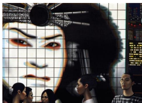
Tokaido Highway "Electric Tokyo" / © Carl Randall 2013