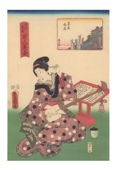
Work exhibited in Part 2. Utagawa Toyokuni III One Hundred Beautiful Women at Famous Places in Edo "Tsumagoi Inari Shrine" Gerstorfer Collection