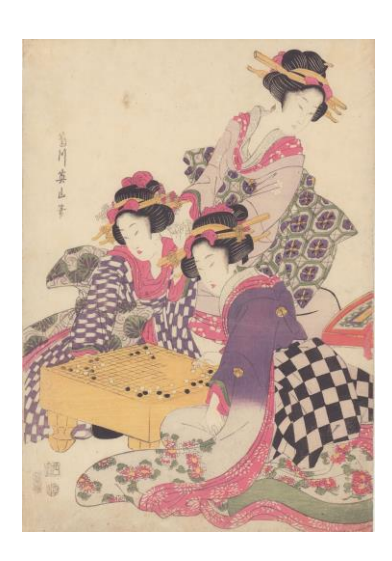
Work exhibited in Part 1. Kikukawa Eizan Elegant Beauties Performing Gerstorfer Collection