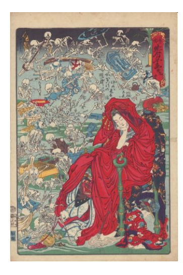
Work exhibited in Part 1. Kawanabe Kyōsai The Ninth Issue of Kyōsai Rakuga "The Picture of the Courtesan of Hell Dreaming of the Skeletons at Play" Gerstorfer Collection