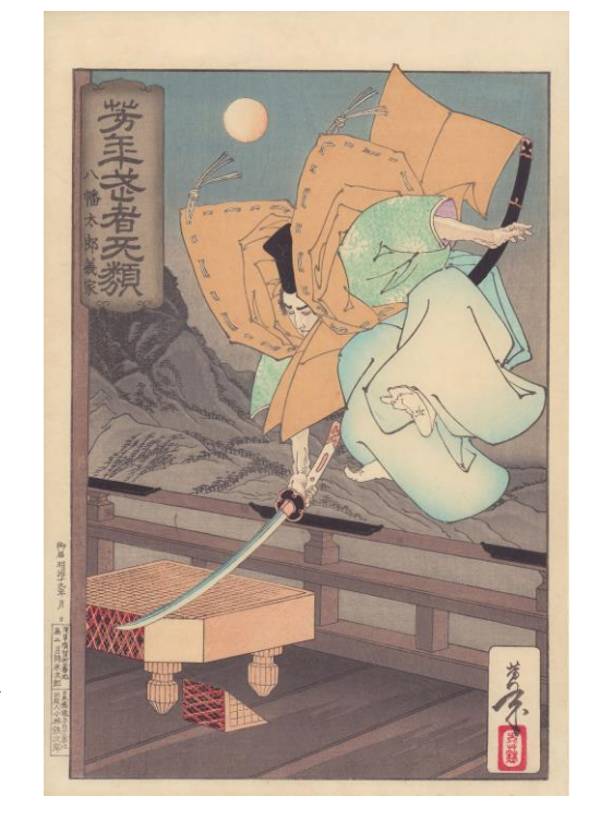
Right Work exhibited in Part 2 Tsukioka Yoshitoshi Yoshitoshi's Warriors Trembling with Courage "Hachiman Taro Yoshiie"