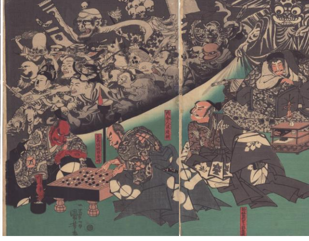
Work exhibited in Part 2. Utagawa Kuniyoshi "Picture of the Ground Spider Manifesting Demons in the Mansion of Prince Minamoto no Yorimitsu" Gerstorfer Collection