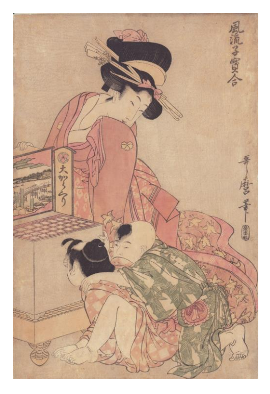
Left Work exhibited in Part 1 Kitagawa Utamaro Elegant Comparisons of Little Treasures "Peep Show" Gerstorfer Collection

We hope you enjoy the many forms of Go culture depicted within Ukiyo-e.