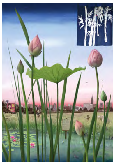
Tokyo Story 1 : Lotus Garden (after Hiroshige) / 2011