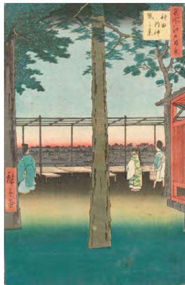
Dawn at the Kanda Myojin Shrine