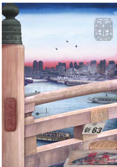
Tokyo Story 2 : Bridge (after Hiroshige) / 2011