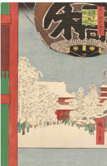
Kinryuzan Temple in Asakusa