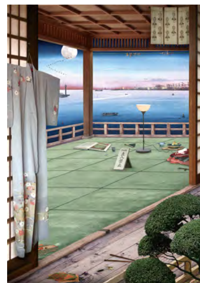
Tokyo Story 4 : Interior (after Hiroshige) / 2011