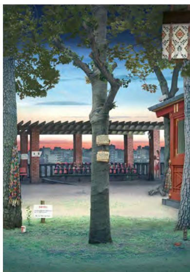
Tokyo Story 6 : Shrine (after Hiroshige) / 2011