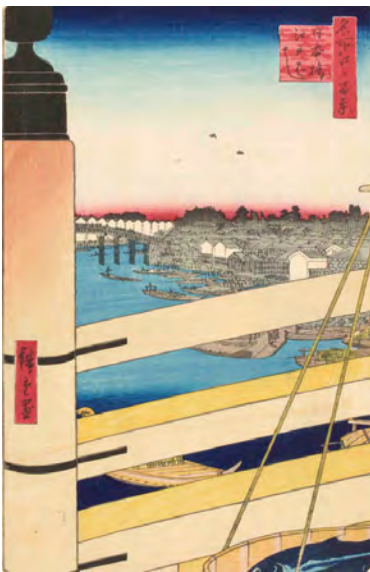
Nihonbashi Bridge and Edobashi Bridge