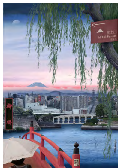
Tokyo Story 10 : Willow Landscape (after Hiroshige) / 2011