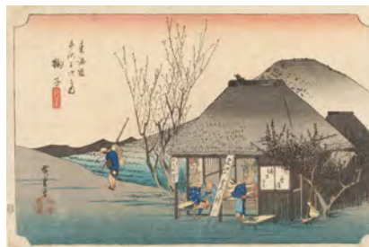
Fifty-Three Stations of the Tokaido (Hoeido Version) “Mariko (The Famous Teahouse)”

Original piece from our collection which this new work is based.