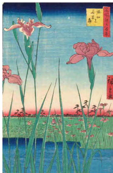
Horikiri Iris Garden