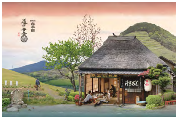
Emily Allchurch : Tokaido Road - Mariko (after Hiroshige) / 2013