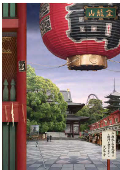
Tokyo Story 8 : Temple (after Hiroshige) / 2011