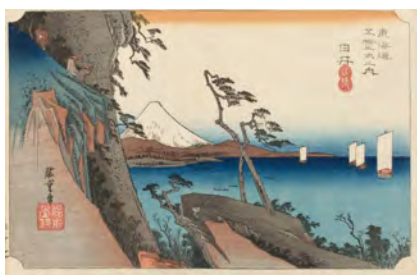
Fifty-Three Stations of the Tokaido (Hoeido Version) “Yui (Satta Pass)”

Original piece from our collection which this new work is based.