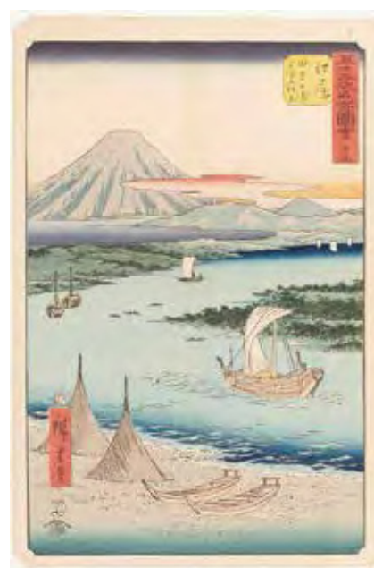
Famous Sights of the Fifty-three Stations (Vertical Tokaido) “Ejiri: Tago Bay and The Pine Forest of Miho”

The Satta Pass, lying between the post-station towns of Yui and Okitsu, was famed both as one of the hardest parts of the Tokaido as well as for providing a superb view of Mt. Fuji. Before the road over the pass was completed, the path at the base of the cliffs where the waves crashed in was so treacherous that it was known as Oyashirazu-Koshirazu (Forget Your Parents, Forget Your Children).