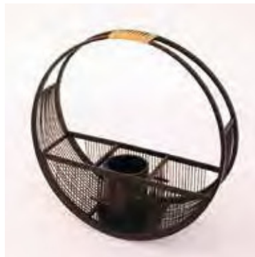
Suruga Bamboo Lattice Ware Flower Vase