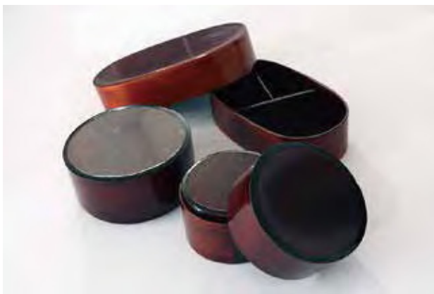
Ikawa Mempa (Wooden Lacquered Lunch Boxes)

Bamboo work is another special product of Shizuoka. Bamboo craft has been an important part of Japanese housewares since the old days, but quality and design have been raised to the level of artwork while still maintaining qualities for practical use. Shizuoka bamboo products were designated by Ministry of Trade and Industry (now the ministry of Economy Trade and Industry) as a Traditional Craft Product in 1976.