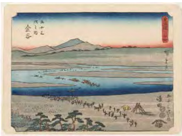
Fifty-three Stations of the Tokaido (Tsutaya Edition) "Shimada and Kanaya"

As indicated by the words dochu-fuzoku (travel customs) included in the works, this series comically shows the people and manners along the Tokaido Road. The setting is the landscape of the post-stations and surrounding areas. Also included are the names of famous places, items as well as the distance to the next post-station. This series served as a travel guide combined with a caricature-style.