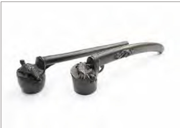
Yatate (Portable Writing Utensil)

Portable writing equipment, with the inkpot and brush-holder formed as one, and the brush being carried inside the tube. These came in a range of materials, from bronze to wood, and were carried thrust into the waist. The lids of the inkpots for these yatate are delicately engraved with a crab (right) and tortoise (left).