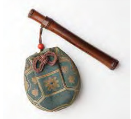
Kiseru (Tobacco Pipe with Metal Tipped Stem)