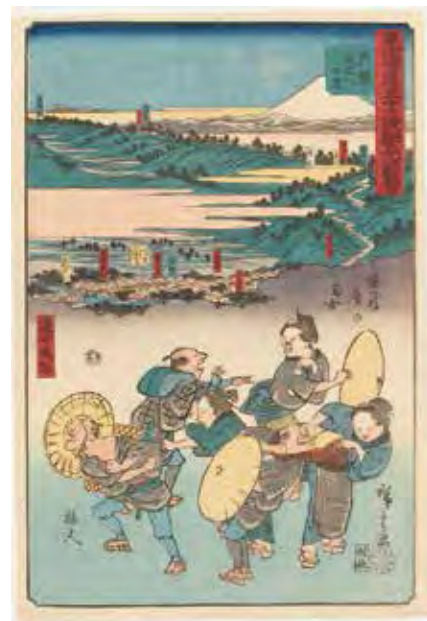
Pictorial Guide to the Fifty-three Stations of the Tokaido "Totsuka"

The Oi River, flowing between the post-station towns of Shimada and Kanaya, was one of the more treacherous sections of the Tokaido, as in the old folk song, "The eight leagues of Hakone can be crossed by a horse, but the Oi River can be crossed by no one". Travellers wanting to cross had to hire people who would carry them on their shoulders or on litters called rendai .