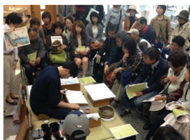
Demonstration and Workshop/ 2013