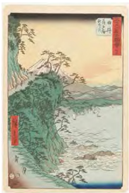
Famous Sights of the Fifty-three Stations (Vertical Tokaido) “Yui: The Frightful Satta Pass”

This series is also called "The Vertical Tokaido" since the majority of the Tokaido guides on famous spots were done in horizontal format. Illustrated travel guides were in fashion and this series includes many works that takes advantage of the vertical format by illustrating scenes from a high viewpoint. Compositional use of an overhead viewpoint as well as the use of extremely enlarged foreground objects to create depth can also be seen in Hiroshige's artistic compilation One Hundred Famous Views of Edo published the following year.