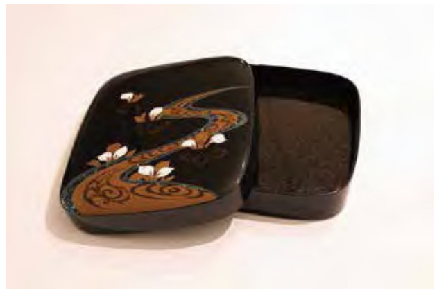
Suruga Makie (Gold Lacquer)