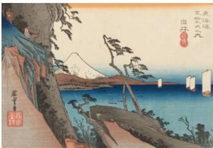
Utagawa Hiroshige "Fifty-Three Stations of the Tokaido (Hoeido Version) Yui, Satta Pass"

Registration will close once all spaces are filled.