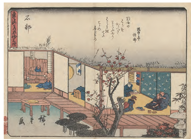
Part2:Utagawa Hiroshige Fifty-three Stations of the Tokaido Road "Ishibe" Collection of Shizuoka City Tokaido Hiroshige Museum of Art