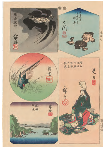
Part2: Utagawa Hiroshige Cutout Pictures of the Tokaido Road "No. 7. Kakegawa, Fukuroi, Mitsuke, Hamamatsu, Maisaka" Collection of Shizuoka City Tokaido Hiroshige Museum of Art