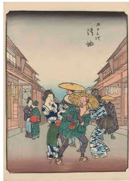
Part1:Utagawa Hiroshige Fifty-three Stations "Goyu" Collection of Shizuoka City Tokaido Hiroshige Museum of Art