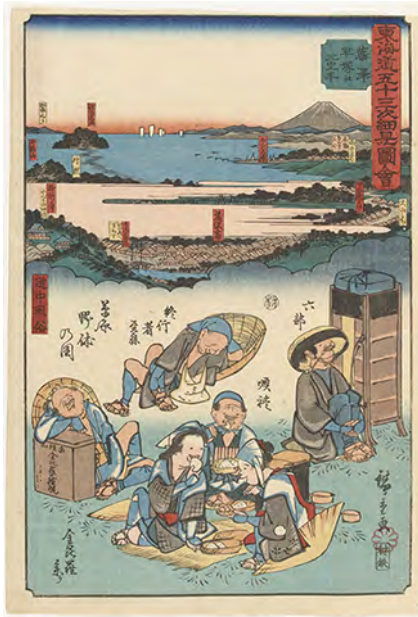
Part1: Utagawa Hiroshige Pictorial Guide to the Fifty-three Stations of the Tokaido "Fujisawa: Pilgrims Resting" Collection of Shizuoka City Tokaido Hiroshige Museum of Art