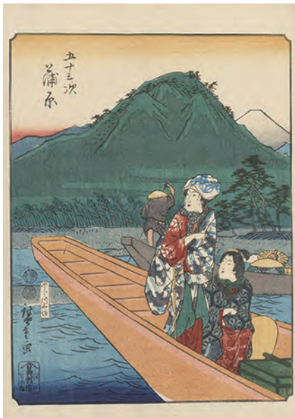
Part1:Utagawa Hiroshige Fifty-three Stations "Kanbara: Ferry on Fuji River" Collection of Shizuoka City Tokaido Hiroshige Museum of Art