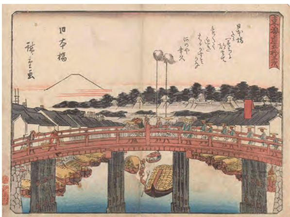
Part2:Utagawa Hiroshige Fifty-three Stations of the Tokaido Road "Nihonbashi" Collection of Shizuoka City Tokaido Hiroshige Museum of Art