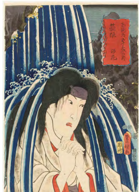
Part2: Utagawa Toyokuni III Fifty-three Stations of the Tōkaidō Road “Hakone: Hatsuhana” Collection of Shizuoka City Tokaido Hiroshige Museum of Art

*Changes may be made to the exhibit content and displayed works.