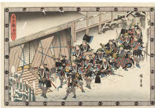
Part2: Utagawa Hiroshige The Storehouse of Loyal Retainers “The Night Attack, Part 2: Breaking into the House” Collection of Shizuoka City Tokaido Hiroshige Museum of Art

“ Kanadehon Chūshingura ” is a piece that was created by incorporating elements from other performances and to avoid strict rules that ban criticisms and satire directed to the Bakufu government, the setting had been shifted to the “ Taiheiki (Record of the Great Peace)” period. Asano Takuminokami had been replaced with Enya Hangan Takasada, an actual person that existed during the late Kamakura period to the Period of Northern and Southern Courts, Kira Kōzukenosuke was replaced by Kō-no-Moronao (Moronō in theatre), the steward of the Ashikaga family, and Ōishi Kuranosuke was changed to Ōboshi Yuranosuke. The title “ Kanadehon Chūshingura ” originates from the fact that the Iroha gana syllabary and the Akō Domain ronin were both 47 and the loyal retainers ( Chūshin ) that gathered at the storehouse ( Kura ) were role models ( Tehon ) of samurai. The title also ties into Ōishi “Kura”nosuke. This exhibition will feature Ukiyo-e pieces based on the “ Chūshingura ” and the outline of the story.