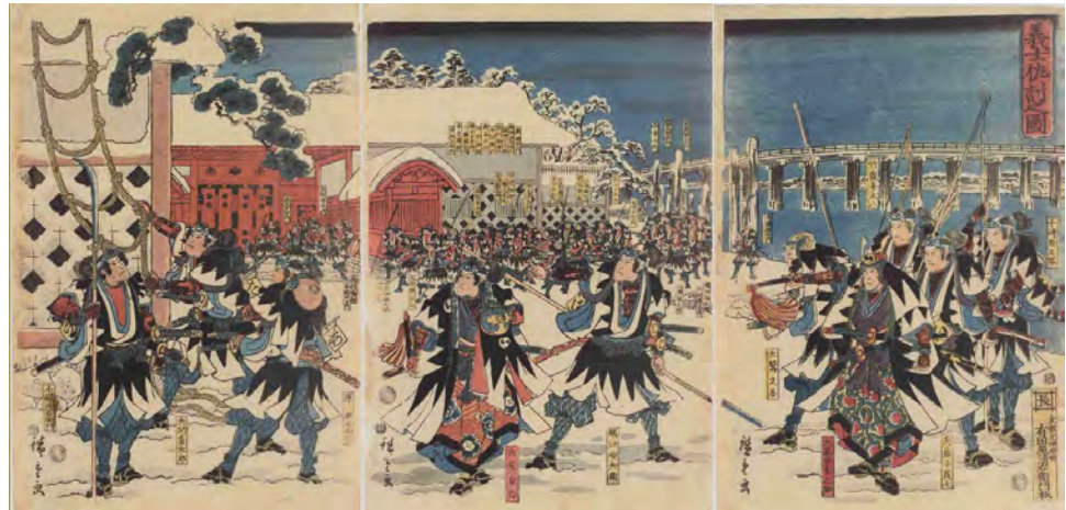
Part1: Utagawa Hiroshige “The Loyal Retainers Take Their Revenge, from Chūshingura”

“ Kanadehon Chūshingura ” is a piece that was created by incorporating elements from other performances and to avoid strict rules that ban criticisms and satire directed to the Bakufu government, the setting had been shifted to the “ Taiheiki (Record of the Great Peace)” period. Asano Takuminokami had been replaced with Enya Hangan Takasada, an actual person that existed during the late Kamakura period to the Period of Northern and Southern Courts, Kira Kōzukenosuke was replaced by Kō-no-Moronao (Moronō in theatre), the steward of the Ashikaga family, and Ōishi Kuranosuke was changed to Ōboshi Yuranosuke. The title “ Kanadehon Chūshingura ” originates from the fact that the Iroha gana syllabary and the Akō Domain ronin were both 47 and the loyal retainers ( Chūshin ) that gathered at the storehouse ( Kura ) were role models ( Tehon ) of samurai. The title also ties into Ōishi “Kura”nosuke. This exhibition will feature Ukiyo-e pieces based on the “ Chūshingura ” and the outline of the story.