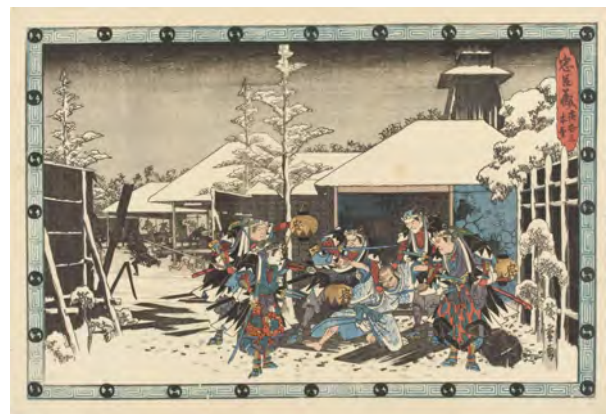
Part2: Utagawa Hiroshige The Storehouse of Loyal Retainers “The Night Attack, Part 3: Achieving the Goal” Collection of Shizuoka City Tokaido Hiroshige Museum of Art