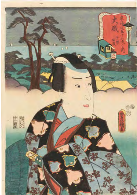
Part1: Utagawa Toyokuni III Fifty-three Stations of the Tōkaidō Road “Ōiso: Jūrō Sukenari”

This exhibition will introduce stories of revenge depicted in Ukiyo-e such as “ Soga Monogatari (The tale of Soga)” and “ Kagiya no Tsuji no Kettō (The Duel at the Key-Maker’s Corner),” which are considered three of Japan’s biggest revenge stories along with “ Chūshingura (The Treasury of Loyal Retainers).” Step into the thrilling world of vengeance that is not a mere revenge success story and learn the rules placed against Katakiuchi (revenge) in the Edo era.