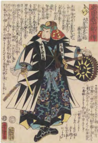
Part1: Utagawa Yoshitora The Story of the Faithful Samurai in The Storehouse of Loyal Retainers “The Syllable I: Ōboshi Yuranosuke Fujiwara no Yoshio”

“ Kanadehon Chūshingura (The Treasury of Loyal Retainers),” a play based on the Akō Incident that occurred during 1701 and 1703, was first performed in August, 1748. The feature was performed as a program of Ningyō Jōruri (Japanese puppet show) at the Takemoto-za theater of Dōtonbori. After receiving critical acclaim, the narrative was performed as Kabuki in January of the following year. In March of the same year, the feature was presented in Edo.