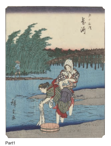
Utagawa Hiroshige Fifty-three Stations "Okazaki" Collection of Shizuoka City Tokaido Hiroshige Museum of Art

Famous Places in Edo "Higashi Hongan Temple at Asakusa" Collection of Shizuoka City Tokaido Hiroshige Museum of Art