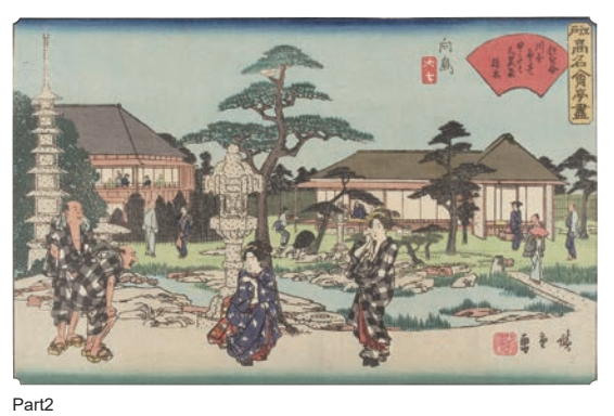
Tatica Utagawa Hiroshige Famous Restaurants in Edo "Mukojima: The Daishichi Restaurant" Collection of Shizuoka City Tokaido Hiroshige Museum of Art

Utagawa Hiroshige One Hundred Famous Views of Edo "Silk-goods Lane in Ödenma-cho" Collection of Shizuoka City Tokaido Hiroshige Museum of Art