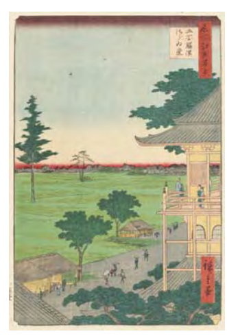
Part1: Utagawa Hiroshige One Hundred Famous Views of Edo "Spiral Hall, Five Hundred Rakan Temple" Museum Collection