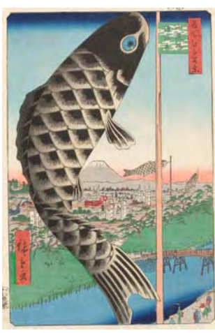
Part2: Utagawa Hiroshige One Hundred Famous Views of Edo "Suidōbashi Bridge and Surugadai" Museum Collection