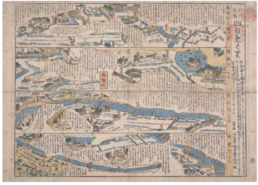
"Diagram for traveling around Edo in four days"

The metropolis, Edo, was also a sightseeing city, and a tourist guidebook (magazine/guide) for those visiting Edo was published around the mid-17th century. This exhibition will be separated in four routes heading south, west, north, and east, as well as introducing Meisho-e by Hiroshige while referring to the guide map, " Diagram for Traveling Around Edo in Four Days " that introduce travel tips for efficiently making the best of four days while in Edo. Enjoy trips around Edo as if you were a traveler of the Edo era.