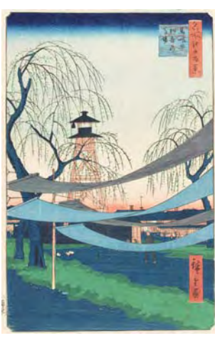
Part3: Utagawa Hiroshige One Hundred Famous Views of Edo "Hatsune no Baba Riding Grounds in Bakurō-chō" Museum Collection