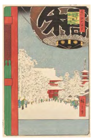
Part3: Utagawa Hiroshige One Hundred Famous Views of Edo "Kinryūzan Temple in Asakusa" Museum Collection