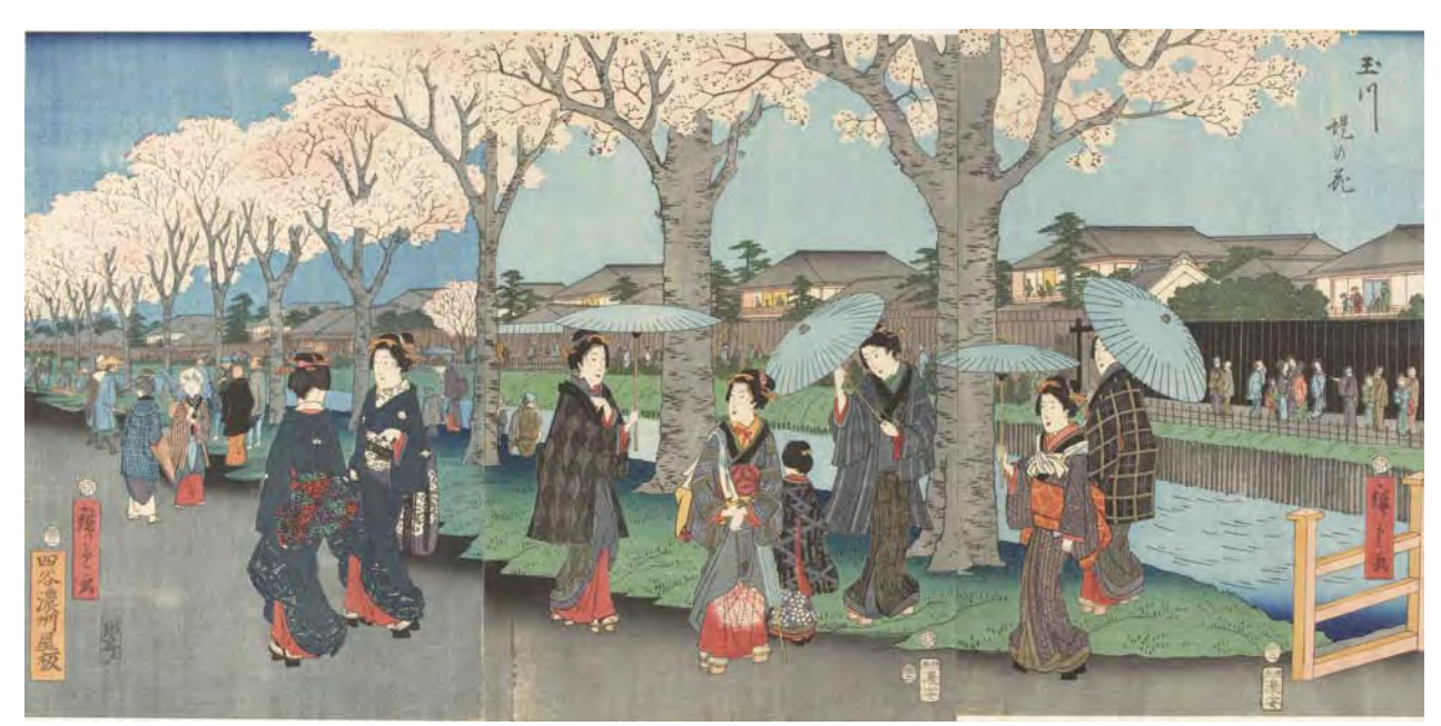
Part1: Utagawa hiroshige "Cherry Blossom on the Tama River Embankment" Museum Collection

In these circumstances, it was only the areas before the barriers that could be traveled freely and accessed without travel permits. Suburbs in Edo that still had a lot of nature, as well as Enoshima, Kamakura, and Hakone Nanayu that were relatively accessible were popular spots to relax and enjoy for the people in Edo. Enjoy the many locations that were enjoyed by the Edo people in the form of Ukiyo-e.