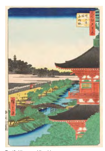
Part2: Utagawa Hiroshige One Hundred Famous Views of Edo "Zōjōji Pagoda and Akabane" Museum Collection