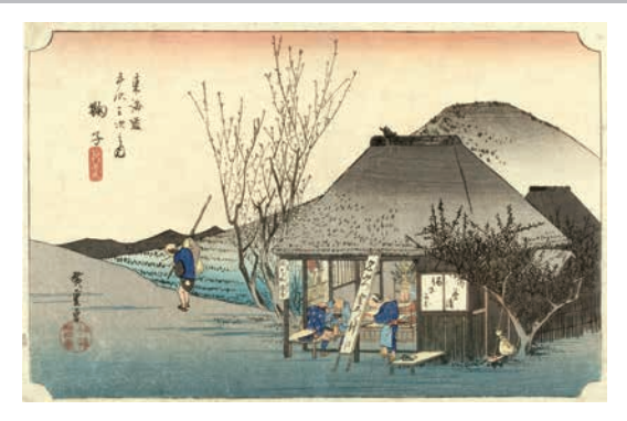
Part2 Utagawa Hiroshige Fifty-Three Stations of the Tokaido "Mariko: The Famous Teahouse" Collection of Shizuoka City Tokaido Hiroshige Museum of Art