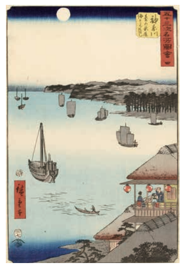
Part3 Utagawa Hiroshige Famous Sights of the Fifty-three Stations "Kanagawa: View over the Sea from the Teahouses on the Embankment" Collection of Shizuoka City Tokaido Hiroshige Museum of Art