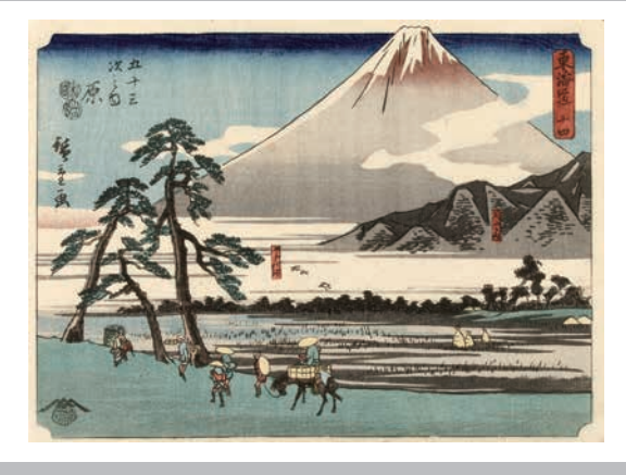
Part1 Utagawa Hiroshige Fifty-three Stations of the Tokaido "Hara" Collection of Shizuoka City Tokaido Hiroshige Museum of Art