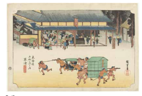
Part2 Utagawa Hiroshige Fifty-Three Stations of the Tokaido "Kusatsu: Famous Rest House" Collection of Shizuoka City Tokaido Hiroshige Museum of Art