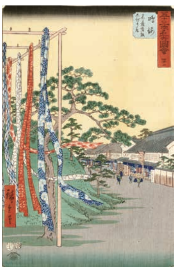
Part3 Utagawa Hiroshige Famous Sights of the Fifty-three Stations "Narumi: Shop with Famous Arimatsu Tie-dyed Cloth" Collection of Shizuoka City Tokaido Hiroshige Museum of Art