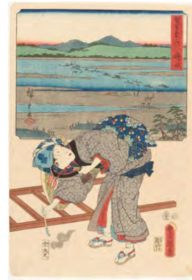
Utagawa Hiroshige, Utagawa Toyokuni III Fifty-three Stations by Two Brushes “Shimada” (Part2)