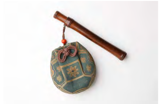
“Portable Cigarette Case” - Chōji-ya Collection