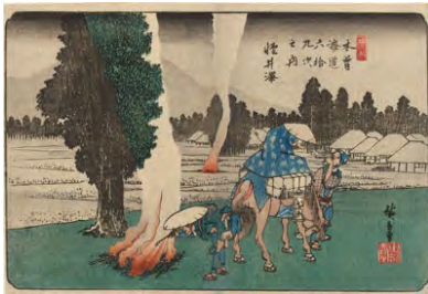
Utagawa Hiroshige Sixty-Nine Stations of the Kisokaidō “Karuizawa” (Part1)