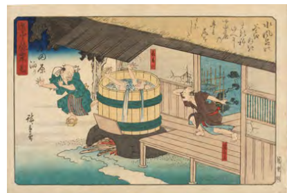
Utagawa Hiroshige Shank's mare “Odawara stay” (Part2)