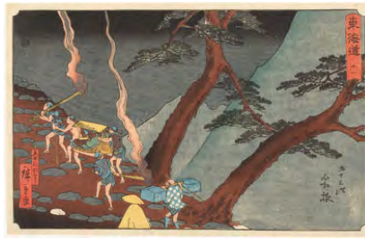
Utagawa Hiroshige Tōkaidō Road “Hakone: Holding Pine Torches in the Night” (Part1)