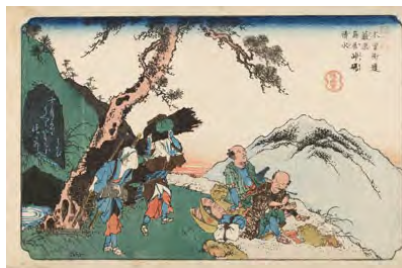
Keisai Eisen Sixty-Nine Stations of the Kisokaidō “Yabuhara” (Part2)