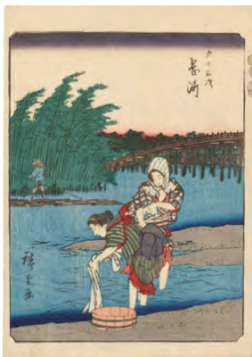
Utagawa Hiroshige Fifty-three Stations “Okazaki” (Part1)