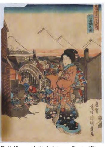
Part1: Utagawa Kunisada (Utagawa Toyokuni III) Fifty-Three Stations of the Tokaido Road "View of Nihonbashi in Edo" Collection of Chojiya