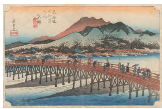
Part2:Utagawa Hiroshige Fifty-Three Stations of the Tokaido Road "Kyoto: Great Sanjo Bridge" Collection of Shizuoka City Tokaido Hiroshige Museum of Art