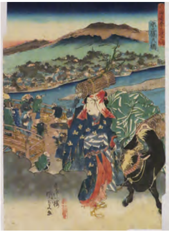
Part2:Utagawa Kunisada (Utagawa Toyokuni III) Fifty-Three Stations of the Tokaido Road "Kyoto: The Great Bridge at Sanjo" Collection of Chojiya