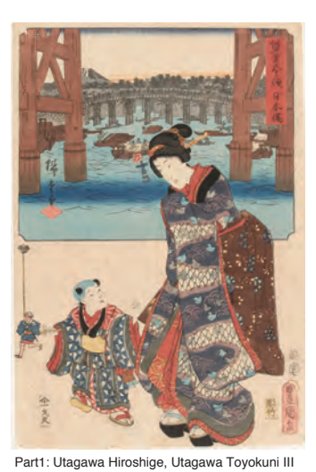
Fifty-three Stations by Two Brushes "Nihonbashi" Collection of Shizuoka City Tokaido Hiroshige Museum of Art