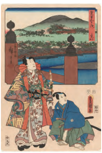
Part2:Utagawa Hiroshige, Utagawa Toyokuni III Fifty-three Stations by Two Brushes "Kyoto The End: The Great Bridge at Sanjo" Collection of Shizuoka City Tokaido Hiroshiqe Museum of Art