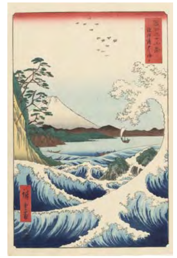
Part2: Utagawa Hiroshige Thirty-six Views of Mount Fuji "The Sea off Satta in Suruga Province" Museum Collection

The vertical Ōban nishiki-e works of " Thirty-six Views of Mount Fuji " were made in 1858, the year Hiroshige passed away, and published by Tsutaya Kichizō the following year. These innovative compositional works make use of the paper's vertical structure by using an overhead view to create depth and perspective as well as using " Kinzo-gata Kōzu " by enlarging objects in the foreground.