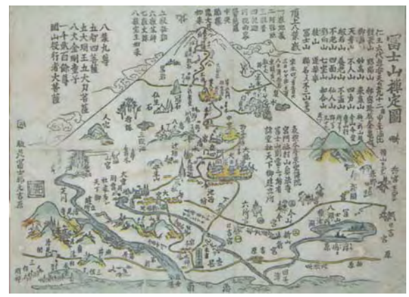
Part1: Fujisan Zenjōzu(Pictorial map) Collection of Mt.Fuji and Princess Kaguya Museum

Mount Fuji is also known as the "one-and-only" mountain and had been worshipped for centuries as the mountain of god from its elegant shape and powerful volcanic eruptions. Mount Fuji had originally been a mountain that was worshipped from a distance but eventually recognized as a mountain to climb and thank gods blessings as volcanic activity had calmed down in the late Heian period. In the late 18th century, Fuji-kō , or groups that climb the Fuji Mountain for worship began to spread amongst the public and eventually Fuji-kō had flourished so much that it could be found anywhere. This exhibition will introduce Fuji, the mountain of faith with Tohai (ascending a mountain for worship) as the theme.