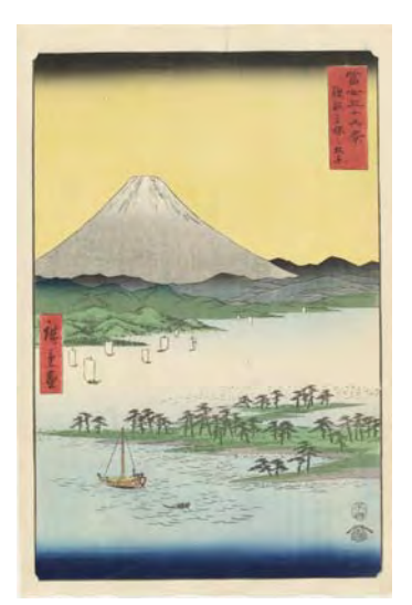
Part2: Utagawa Hiroshige Thirty-six Views of Mount Fuji "The Pine Forest of Miho in Suruga Province" Museum Collection