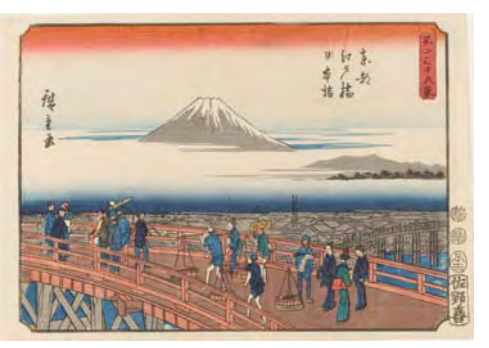
Part1: Utagawa Hiroshige Thirty-six Views of Mount Fuji "Edobashi Bridge and Nihonbashi Bridge in the Eastern Capital" Museum Collection