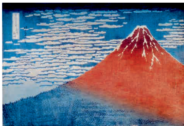
Part1 Katsushika Hokusai Thirty-six Views of Mount Fuji "Fine Wind, Clear Weather" Collection of Kuboso Memorial Museum of Arts, Izumi