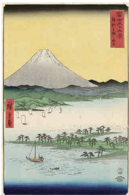
Part1 Utagawa Hiroshige Thirty-six Views of Mount Fuji "The Pine Forest of Miho in Suruga Province" Collection of Shizuoka City Tokaido Hiroshige Museum of Art