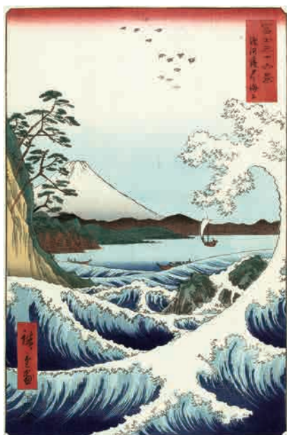
Part2 Utagawa Hiroshige Thirty-six Views of Mount Fuji "The Sea off Satta in Suruga Province" Collection of Shizuoka City Tokaido Hiroshige Museum of Art