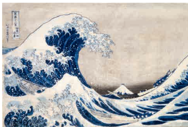
Part2 Katsushika Hokusai Thirty-six Views of Mount Fuji "Under the Wave off Kanagawa" Collection of Kuboso Memorial Museum of Arts, Izumi