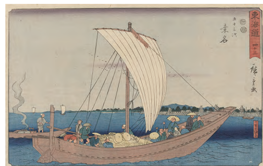
Part2:Utagawa Hiroshige Tokaido Road “Kuwana: Ferryboat at Shichiri Crossing” Collection of Shizuoka City Tokaido Hiroshige Museum of Art