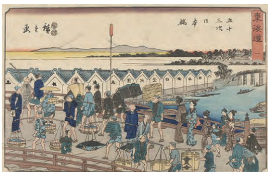
Part2:Utagawa Hiroshige Tokaido Road “Nihonbashi” Collection of Shizuoka City Tokaido Hiroshige Museum of Art

Published during 1849 and 1852 - this is a series of work called “Reisho Tokaido” as the title is written in Clerical script (Reisho script).