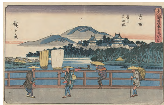
Part1:Utagawa Hiroshige Fifty-Three Stations of the Tokaido “Yoshida: Toyo River and Yoshida Bridge” Collection of Shizuoka City Tokaido Hiroshige Museum of Art