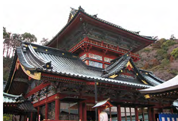
Shizuoka Sengen Shrine