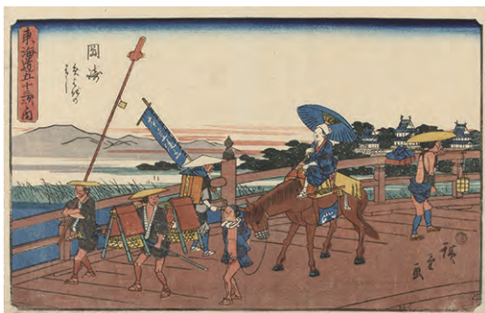
Part1:Utagawa Hiroshige Fifty-Three Stations of the Tokaido “Okazaki: Yahagi Bridge” Collection of Shizuoka City Tokaido Hiroshige Museum of Art

Published during 1841 and 1843 - this is a series of work called “Gyosho Tokaido” as the title is written in semi-cursive script (Gyosho script).