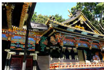
Kunozan Toshogu Shrine