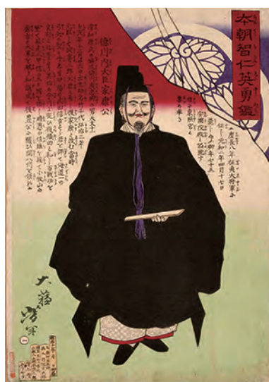
Taiso Yoshitoshi (Tsukioka Yoshitoshi) Mirror of wisdom and humanity of heroes of Japan "Tokugawa Ieyasu" Collection of Shizuoka Prefecture Central Library

Including the years that Ieyasu was a hostage of the Imagawa, Ieyasu spent 1/3 of his life in Shizuoka; therefore, there are many historical sites related to Ieyasu in the area. This exhibition will introduce documents related to Ieyasu that remain in temples and shrines of Shizuoka along with his footsteps.