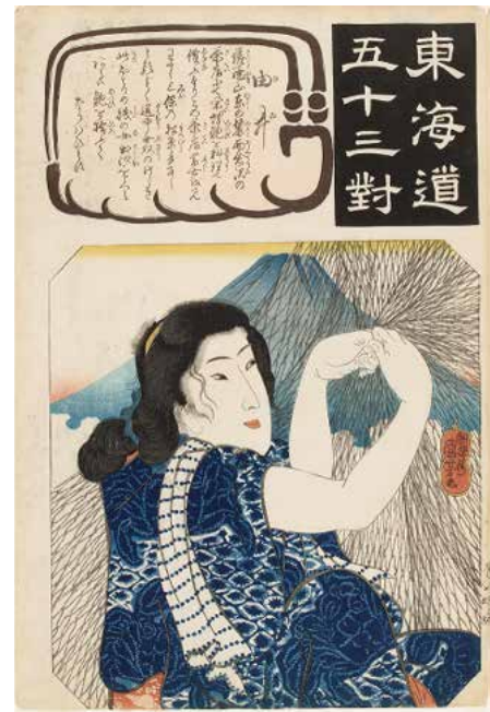
Utagawa Kuniyoshi Fifty-three Pairings for the Tōkaidō Road “Yui”