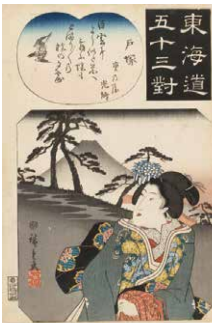
Utagawa Hiroshige Fifty-three Pairings for the Tōkaidō Road “Totsuka”

We will introduce heroines depicted from Kabuki programs related to post-towns along the Tōkaidō and legends that transcend various generations. As with “character” images familiarized today, there were also women who were adored by the people of Edo. Take a look at the actresses that sadly, mysteriously, and beautifully play the part of the heroine in each of their respective stories.