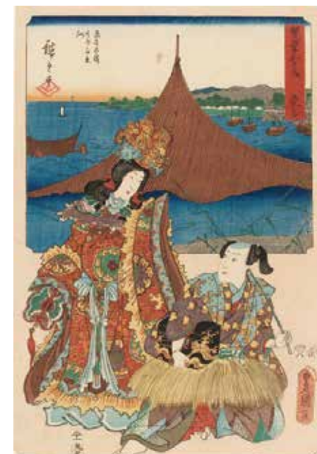
Utagawa Hiroshige, Utagawa Toyokuni III Fifty-three Stations by Two Brushes “Kuwana”