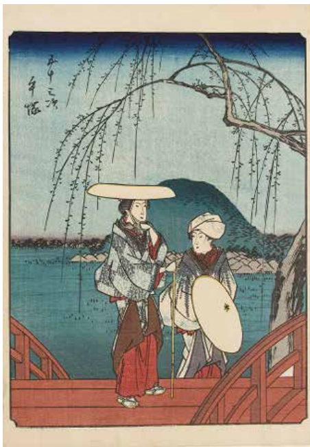
Utagawa Hiroshige Fifty-three Stations “Hiratsuka”

Exhibited pieces include various depictions of women such as those that travel along the Tōkaidō and popular specialties / social customs of each post-town. Differences between popular culture in Edo and Kyō have also been recognized in the work with apparent differences in women's fashion styles. Enjoy a fresh take on the Tōkaidō from a female perspective.