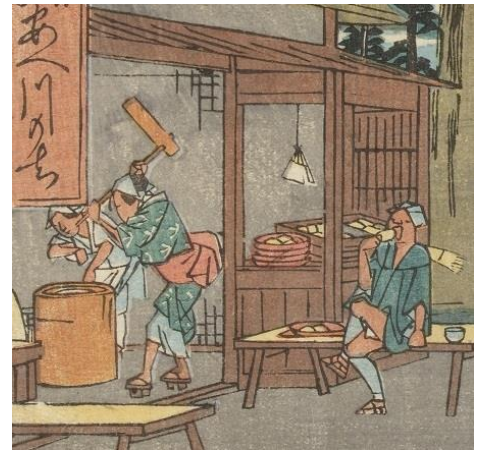
Work exhibited in Part 2.

Abekawa mochi are rice cakes topped with soybean flour. They are famous for being served to Tokugawa Ieyasu and made to look as if they were topped with gold dust acquired from the upper stream of Abekawa River.