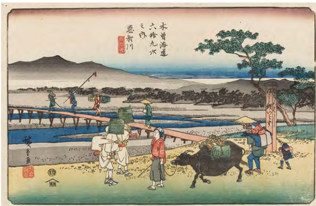
Part1:Utagawa Hiroshige Sixty-Nine Stations of the Kisokaido "Echigawa" Collection of Shizuoka City Tokaido Hiroshige Museum of Art