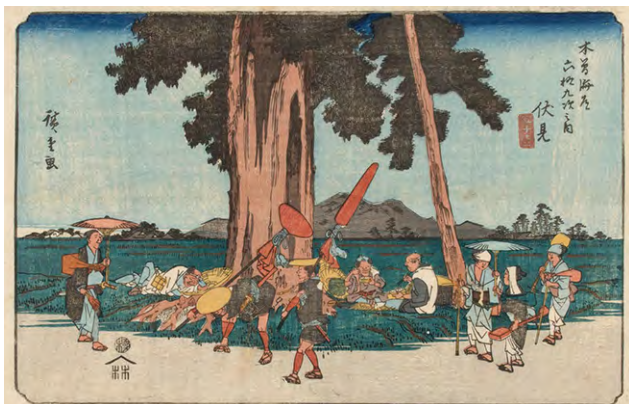
Part2:Utagawa Hiroshige Sixty-Nine Stations of the Kisokaido "Fushimi" Collection of Shizuoka City Tokaido Hiroshige Museum of Art