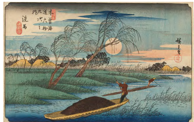
Part2:Utagawa Hiroshige Sixty-Nine Stations of the Kisokaido "Seba" Collection of Shizuoka City Tokaido Hiroshige Museum of Art