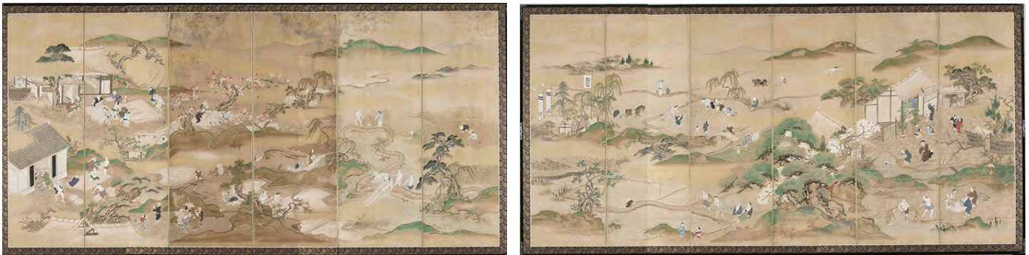
Part1: "Grain production through the four seasons" Collection of Shizuoka City Tokaido Hiroshige Museum of Art

Since the Shizuoka City Tokaido Hiroshige Museum of Art was established in 1994, the museum has collected mainly Ukiyo-e Hanga pieces by Utagawa Hiroshige which totals to approximately 1,400 pieces. This exhibition will feature pieces that have not had much opportunity to display due to the year they were created, their shape, or their theme. Please enjoy this unique "Tokaido Hiroshige Museum of Art" collection featuring "Grain production through the four seasons" (Part1) and "Merrymaking Under the Cherry Blossoms" (Part2) that will be displayed for the first time after nearly 10 years.