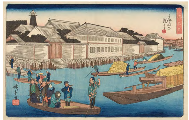
Part1:Utagawa Hiroshige Scenic Spots of Edo "Yoroi Ferry" Collection of Shizuoka City Tokaido Hiroshige Museum of Art