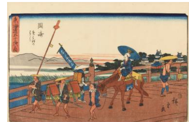
Work exhibited in Part 3. Utagawa Hiroshige Fifty-Three Stations of the Tōkaidō “Okazaki: Yahagi Bridge”