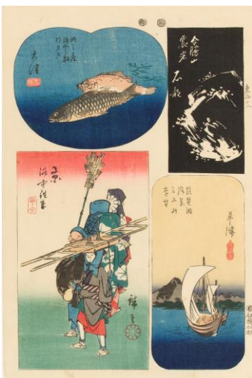
Work exhibited in Part 3. Utagawa Hiroshige Cutout Pictures of the Tōkaidō Road “12-Ishibe, Kusatsu, Ōiso, Kyoto”

We will introduce some other series pieces that Hiroshige has created. For example, things accompanied by comical Tanka and things drawn in caricature. Please enjoy various Hiroshige’s Tōkaidō works!