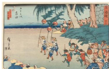
Work exhibited in Part 2. Utagawa Hiroshige Tōkaidō Road “Yoshida: The Tennō Festival on the Fifteenth Day of the Sixth Month”