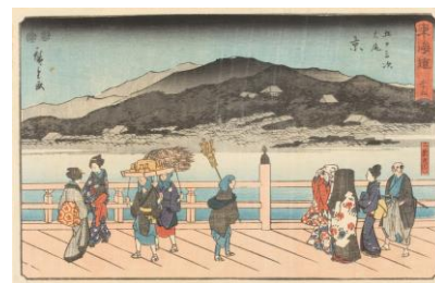
Work exhibited in Part 3. Utagawa Hiroshige Tōkaidō Road; The End “Kyoto: The Great Bridge at Sanjō”