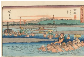
Work exhibited in Part 2. Utagawa Hiroshige Fifty-Three Stations of the Tōkaidō “Kanaya: The Tōtōmi Side of the Ōi River”