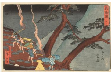
Work exhibited in Part 1. Utagawa Hiroshige Tōkaidō Road “Hakone: Holding Pine Torches in the Night”

Published during 1849 and 1852 - this is a series of work called “Reisho Tōkaidō” as the title is written in Clerical script (Reisho script). The series is known for its thick colors and rather thick lines.