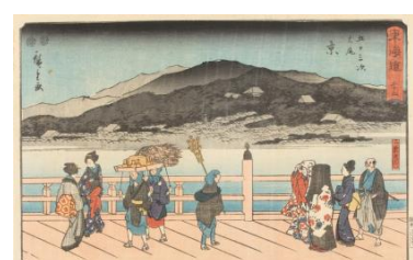
Work exhibited in Part 3. Utagawa Hiroshige Tōkaidō Road; The End “Kyoto: The Great Bridge at Sanjō”