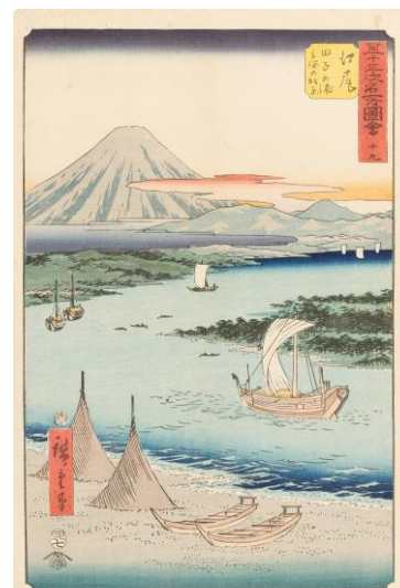
Work exhibited in Part 2. Utagawa Hiroshige Famous Sight of the Fifty-Three Stations “19-Ejiri: Tago Bay and the Pine Forest of Miho”