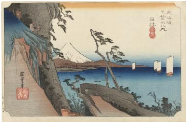
Work exhibited in Part 1. Utagawa Hiroshige Fifty-Three Stations of the Tōkaidō “Yui: Satta Pass”

Published around 1833 - this is a series of work called the “Tōkaidō Hoeidō Edition”. The name comes from the publisher, Hoeidō. It is Hiroshige's first piece of the Tōkaidō series and is critically acclaimed globally for the many elements in the piece that touches the hearts of travelers.