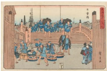
Work exhibited in Part 1. Utagawa Hiroshige Fifty-Three Stations of the Tōkaidō “Nihonbashi”

Published around 1841 - this is a series of work called “Gyōsho Tōkaidō” as the title is written in semi-cursive script (Gyōsho script). A unique quality of the series is in its light tone and colors.