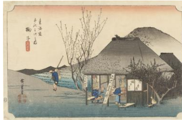
Work exhibited in Part 2. Utagawa Hiroshige Fifty-Three Stations of the Tōkaidō “Mariko: The Famous Teahouse”