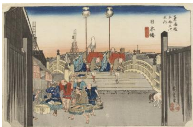
Work exhibited in Part 1. Utagawa Hiroshige Fifty-Three Stations of the Tōkaidō “Nihonbashi: Morning Scene”

※The post-towns exhibited in each term changes. (Part1:Nihonbashi – Okitsu / Part2:Ejiri – Akasaka / Part3:Fujikawa – Kyo)