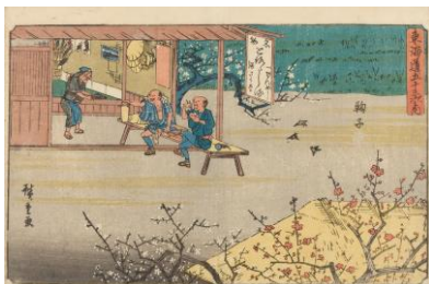
Work exhibited in Part 2. Utagawa Hiroshige Fifty-Three Stations of the Tōkaidō “Mariko”