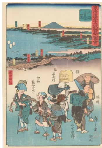
Work exhibited in Part 1. Utagawa Hiroshige Pictorial Guide to the Fifty-Three Stations of the Tōkaidō “Ōiso to Odawara, Four Ri”