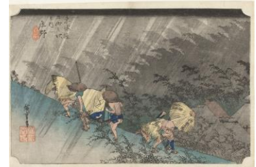
Work exhibited in Part 3. Utagawa Hiroshige Fifty-Three Stations of the Tōkaidō “Shōno: Rainstorm”