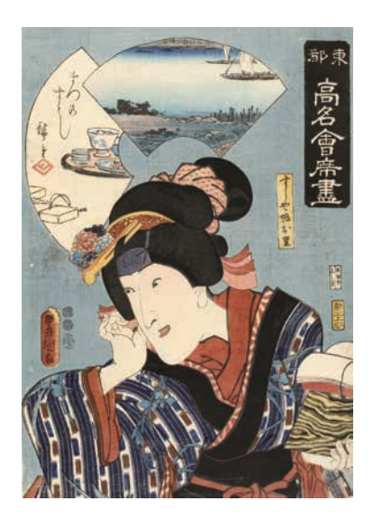
Part2 Utagawa Hiroshige, Utagawa Toyokuni III Famous Restaurants of the Eastern Capital "The Matsunosushi Restaurant: Osato" Collection of Shizuoka City Tokaido Hiroshige Museum of Art