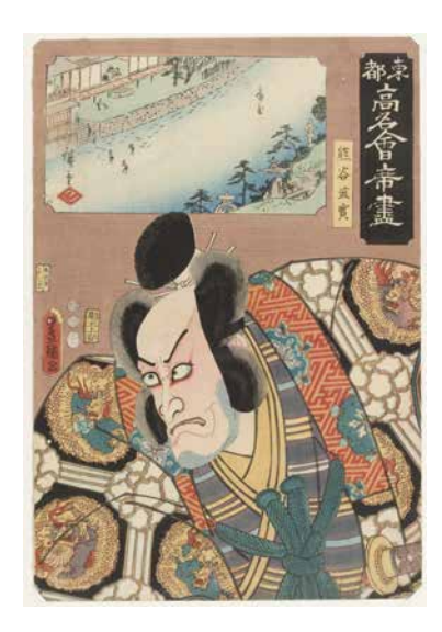
Part2 Utagawa Hiroshige, Utagawa Toyokuni III Famous Restaurants of the Eastern Capital "The Ogiya Restaurant: Kumagai Naozane" Collection of Shizuoka City Tokaido Hiroshige Museum of Art