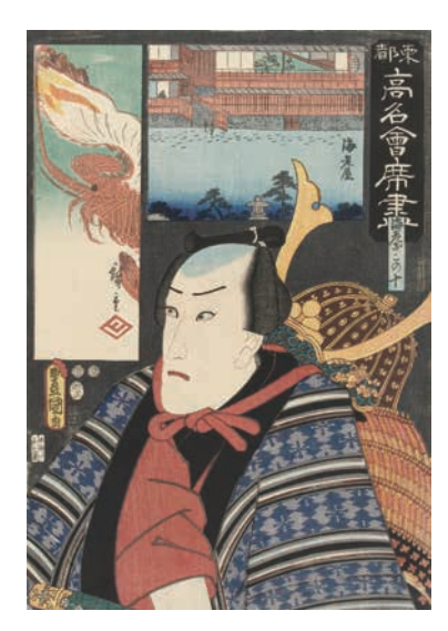
Part2 Utagawa Hiroshige, Utagawa Toyokuni III Famous Restaurants of the Eastern Capital "The Ebiya Restaurant: Ebizako no ju" Collection of Shizuoka City Tokaido Hiroshige Museum of Art