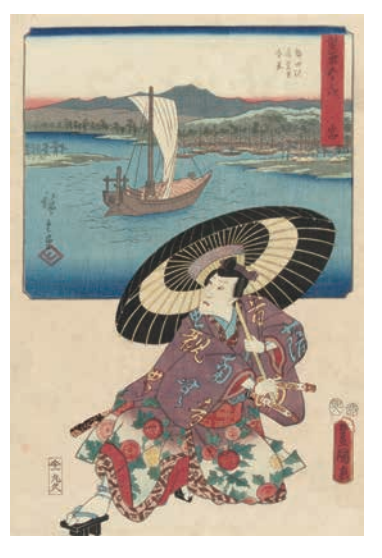
Part1 Utagawa Hiroshige, Utagawa Toyokuni III Fifty-three Stations by Two Brushes "Miya: Distant View of Atsuta Station and Nezame Village" Collection of Shizuoka City Tokaido Hiroshige Museum of Art