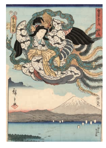
Part1 Utagawa Hiroshige, Utagawa Toyokuni III Fifty-three Stations by Two Brushes "Ejiri: The Pine Tree of the Feather Robe at Miho no Matsubara" Collection of Shizuoka City Tokaido Hiroshige Museum of Art