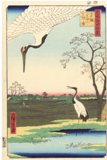
Part1 Utagawa Hiroshige, One Hundred Famous Views of Edo "Minowa, Kanasugi and Mikawashima" Collection of Shizuoka City Tokaido Hiroshige Museum of Art