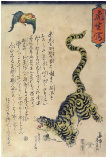
Part1 Utagawa Yoshitomi "Tiger Drawn from Life" Collection of Shizuoka City Tokaido Hiroshige Museum of Art