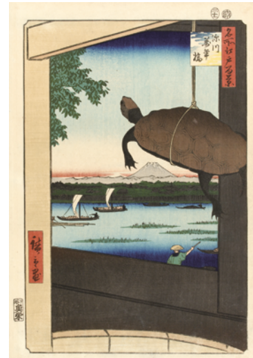
Part1 Utagawa Hiroshige, One Hundred Famous Views of Edo "Mannen Bridge at Fukagawa" Collection of Shizuoka City Tokaido Hiroshige Museum of Art