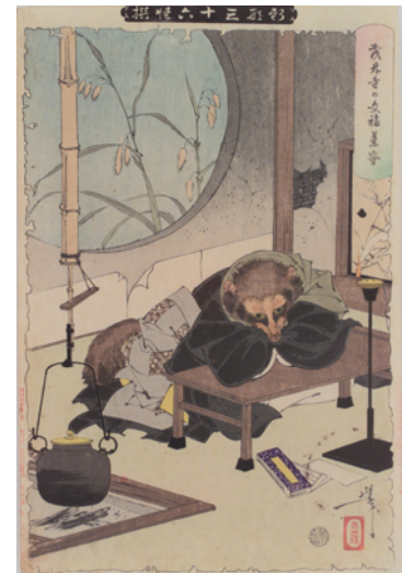
Part2 Tsukioka Yoshitoshi The new forms of the thirty-six ghosts "Mysterious teakettle of Morinji temple" Collection of Shizuoka Prefectural Central Library