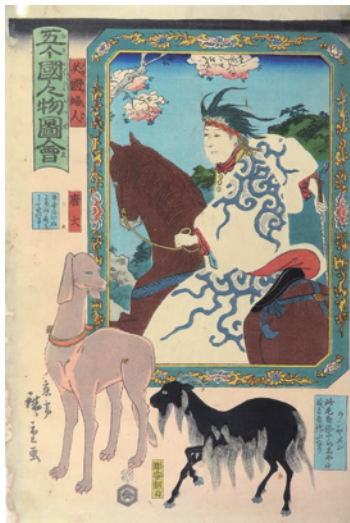
Part2 Utagawa Hiroshige II People of Five Different Countries "British Lady" Collection of Shizuoka City Tokaido Hiroshige Museum of Art