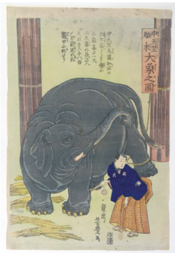
Part2 Utagawa Yoshitoyo "The Great Elephant Imported from Central India" Collection of Shizuoka City Tokaido Hiroshige Museum of Art