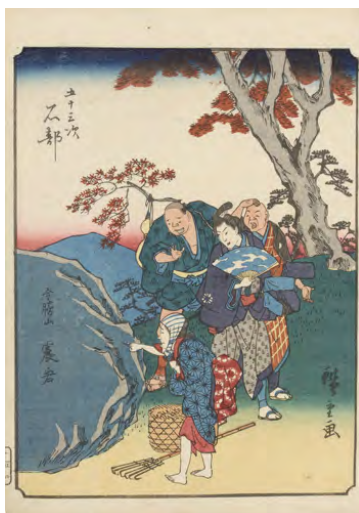
Utagawa Hiroshige Fifty-three Stations "Ishibe" Collection of Shizuoka City Tokaido Hiroshige Museum of Art