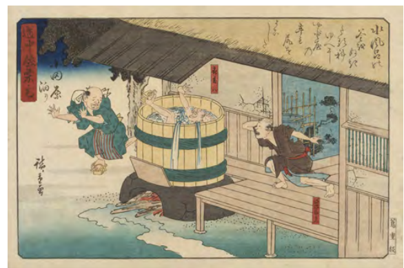
Utagawa Hiroshige Shank's mare "Odawara stay" Collection of Shizuoka City Tokaido Hiroshige Museum of Art