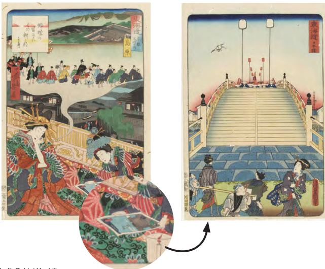
Left: Ochiai Yoshiiku Scenes of Famous Places along the Tōkaidō Road "Shimabara" Collection of Shizuoka City Tokaido Hiroshige Museum of Art Right: Utagawa Toyokuni III Scenes of Famous Places along the Tōkaidō Road "Nihonbashi" Collection of Shizuoka City Tokaido Hiroshige Museum of Art