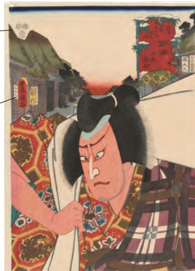
(Part1) Utagawa Toyokuni III Fifty-three Stations of the Tōkaidō Road "Goyu: Yamamoto Kansuke" Collection of Shizuoka City Tokaido Hiroshige Museum of Art