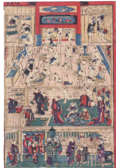
Utagawa Yoshifuji "Ladies' bath of the cat" Collection of Shizuoka Prefectural Central Library