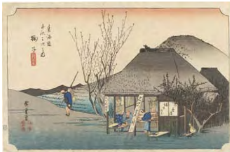
Part1: Utagawa Hiroshige Fifty-Three Stations of the Tōkaidō "Mariko: The Famous Teahouse" Collection of Shizuoka City Tokaido Hiroshige Museum of Art

Published about 1833 - this is a series of work called "Hoeidō Edition" as it was published by Hoeidō.