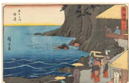
Part2: Utagawa Hiroshige Tōkaidō Road "Yui" Collection of Shizuoka City Tokaido Hiroshige Museum of Art

Published during 1849 and 1852 - this is a series of work called "Reisho Tōkaidō" as the title is written in Clerical script (Reisho script).