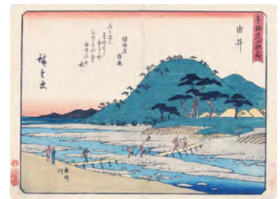
Part1: Utagara Hiroshige Fifty-three Station of the Tōkaidō road “Yui Yui River” Shizuoka City Tokaido Hiroshige Museum of Art Collection

“Two Mountain Passes Eight Stations” is a collective name that refers to the eight post towns of Kambara, Yui, Okitsu, Ejiri, Fuchū, Mariko, Okabe, and Fujieda along the old Tōkaidō in the cities of Fujieda and Shizuoka, as well as the two difficult mountain passes: Satta mountain pass between Yui and Okitsu and the Utsunoya mountain pass between Mariko and Okabe.