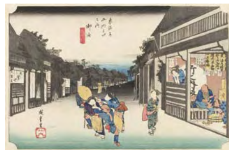
Part1: Utagawa Hiroshige Fifty-Three Stations of the Tōkaidō "Goyu: Women Soliciting Travelers" Collection of Shizuoka City Tokaido Hiroshige Museum of Art