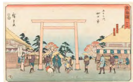
Part2: Utagawa Hiroshige Tōkaidō Road "Yokkaichi: Crossroads at Hinaga Village and Road to Ise Shrine"