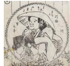
Jippensha Ikku Shanks' Pony along the Tōkaidō "Beginning" Collection of Shizuoka City Tokaido Hiroshige Museum of Art