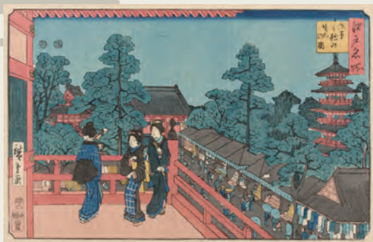
Part1 Exhibit: Utagawa Hiroshige Famous Places in Edo "Temple grounds of Kinryūzan at Asakusa" Collection of Shizuoka City Tokaido Hiroshige Museum of Art