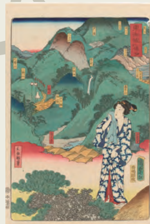
Part2 Exhibit: Utagawa Kunisada II Scenes of Famous Places along the Tōkaidō Road "Hot Springs at Hakone" Collection of Shizuoka City Tokaido Hiroshige Museum of Art