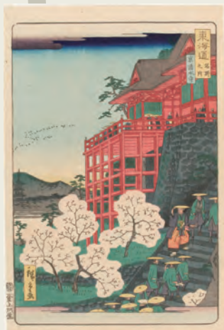
Part1 Exhibit: Utagawa Hiroshige II Scenes of Famous Places along the Tōkaidō Road "Kyōto: Kiyomizu Temple" Collection of Shizuoka City Tokaido Hiroshige Museum of Art