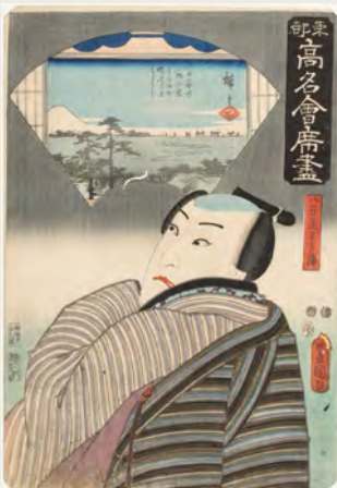
Part1 Exhibit: Utagawa Hiroshige, Utagawa Toyokuni III Famous Restaurants of the Eastern Capital “The Yaozen Restaurant: Yaoya Hanbei” Collection of Shizuoka City Tokaido Hiroshige Museum of Art

A representative of the High-class restaurant in Edo Era.