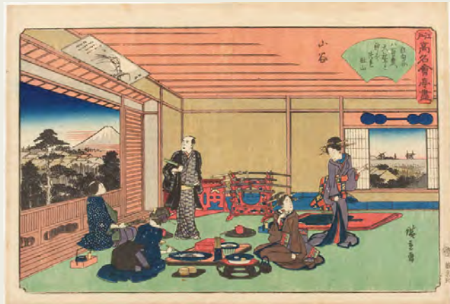
Part2 Exhibit: Utagawa Hiroshige Famous Restaurants of Edo “San’ ya: The Yaozen Restaurant” Collection of Shizuoka City Tokaido Hiroshige Museum of Art

The people of Edo loved rankings. Restaurant guides that replicated sumo ranking charts were published that ranked fish by grade from high, average, and low.