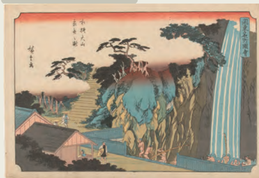
Part2 Exhibit: Utagawa Hiroshige Famous Views of the Kantō Region "The Rōben Waterfall at Ōyama in Sagami Province" Collection of Shizuoka City Tokaido Hiroshige Museum of Art