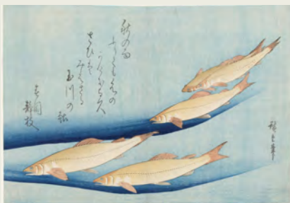
Part2 Exhibit: Utagawa Hiroshige Grand Series of Fishes “Ayu” Collection of Shizuoka City Tokaido Hiroshige Museum of Art

The people of Edo loved rankings. Restaurant guides that replicated sumo ranking charts were published that ranked fish by grade from high, average, and low.