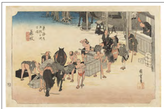
▲ (Part2) Utagawa Hiroshige Fifty-three Stations of the Tōkaidō "Fujieda" Museum Collection