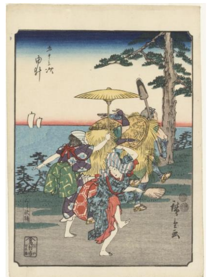
Fifty-three Stations "Yui"