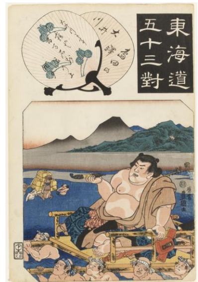
Utagawa Toyokuni III / Fifty-three Pairings for the Tokaido Road “Shimada Station: The Oi River”