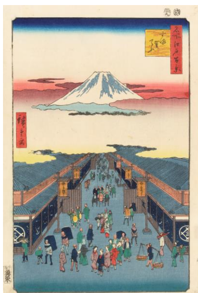
Work exhibited in Part 2. Utagawa Hiroshige / One Hundred Famous Views of Edo “Suruga-chō” Collection of Shizuoka City Tokaido Hiroshige Museum of Art

We have specially selected a variety of scenery prints including Sixty-nine Stations of the Kisokaidō Road by Hiroshige and Keisai Eisen, One Hundred Famous Views of Edo by Hiroshige in his later years, and Famous Restaurants of Edo that depicted a famous restaurant in Edo. Please enjoy scenery prints from a fresh new perspective.