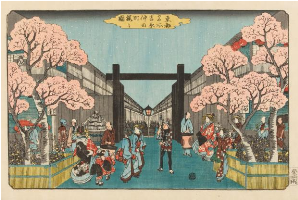
Work exhibited in Part 1. Utagawa Hiroshige / Famous Places in the Eastern Capital "Cherry Blossoms on Naka-no-chō in the Yoshiwara" Collection of Shizuoka City Tokaido Hiroshige Museum of Art

Ukiyo-e was a popular form of media to promote various things such as famous sights, local delicacies, actors, and Kabuki programs. From the common to the unusual, this exhibition will introduce Ukiyo-e that were used for advertising. Exhibited items will include Ukiyo-e that show signs of the Edo era and advertisements that uses the paper media but not in the Ukiyo-e style.