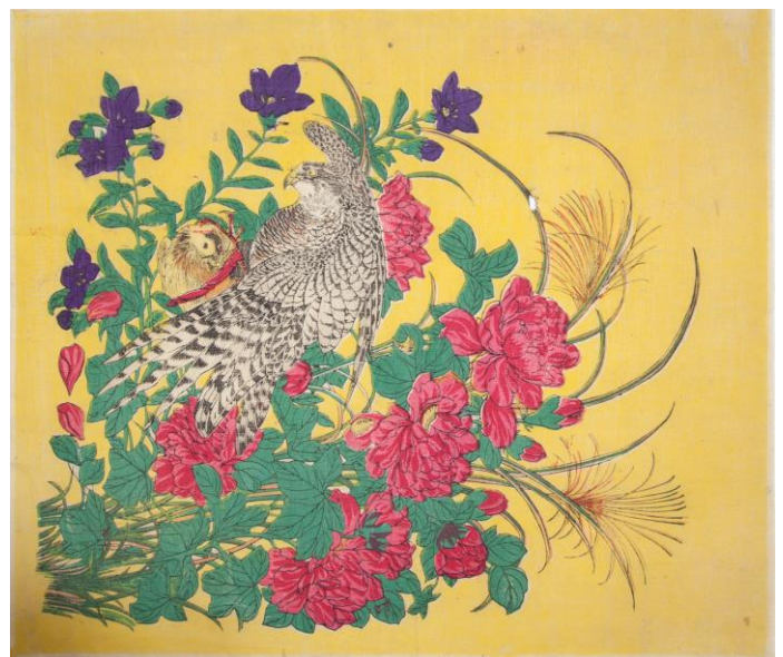
Work exhibited in Part 2. Unknown / Chabako-e (Chinese-style) Collection of Shizuoka City