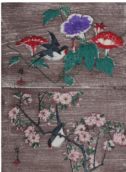
Work exhibited in Part 1. Utagawa Hiroshige II / Chabako-e (Cherry blossoms, a morning glory and swallows) Collection of Fujieda Municipal Museum of History

After the opening of ports in the Bakumatsu era, the tea (tea leaves) export business gained popularity. The emerging business introduced tea boxes, or the Chabako , which had labels designed with Ukiyo-e techniques. This exhibition shows how these labels were actually used for the Chabako and displays the actual labels themselves.