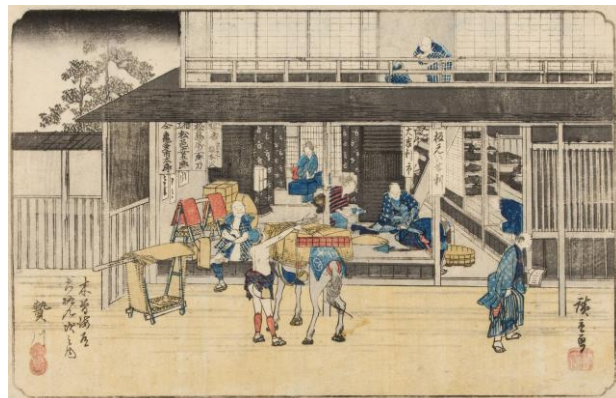
Work exhibited in Part 1. Utagawa Hiroshige / Sixty-Nine Stations of the Kisokaidō Road “Niegawa” Collection of Shizuoka City Tokaido Hiroshige Museum of Art