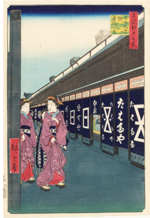
Work exhibited in Part 1. Utagawa Hiroshige / One Hundred Famous Views of Edo "Momendana Cotton-goods Lane in Ōdenma-chō" Collection of Shizuoka City Tokaido Hiroshige Museum of Art