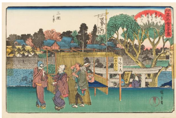
Work exhibited in Part 2. Utagawa Hiroshige / Famous Restaurants of Edo “Dewey and a View of Mimeguri” Collection of Shizuoka City Tokaido Hiroshige Museum of Art