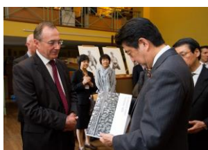
Prime Minister Shinzo Abe viewing Randall's works. (University College London; May 1st, 2014)

*The catalog appearing on the right will be on sale at the museum during the exhibition. *Works in the photograph will not be displayed in this exhibition.