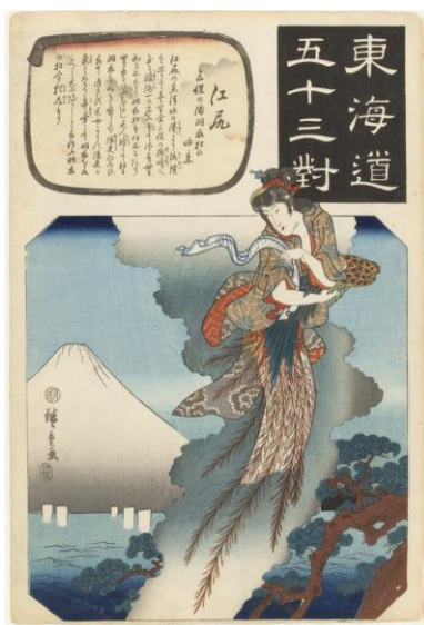
Utagawa Hiroshige / Fifty-three Pairings for the Tokaido Road “Ejiri: The Story of the Pine Tree of the Feather Cloak at Miho Bay”