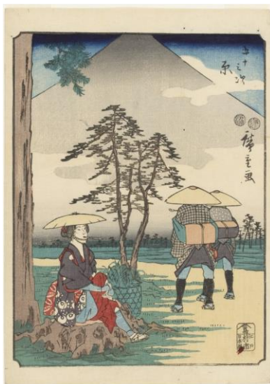
Fifty-three Stations "Hara"