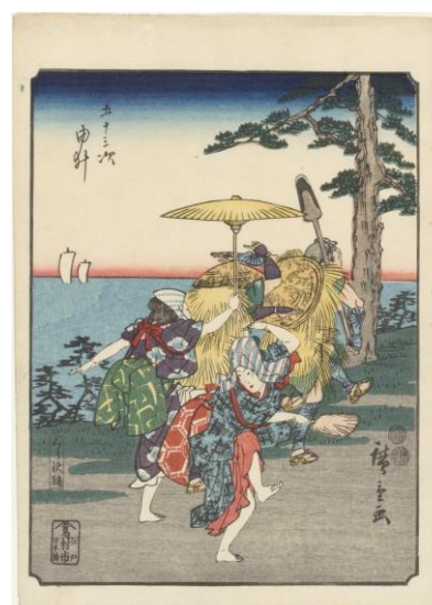
Fifty-three Stations "Yui"