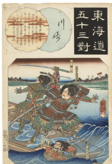
Utagawa Kuniyoshi / Fifty-three Pairings for the Tokaido Road “Kawasaki”

The Fifty-three Pairings for the Tokaido Road is a series created at the end of the Edo period by three of the most famous members of the Utagawa School, Hiroshige, Toyokuni III, and Kuniyoshi. The main theme is not the landscapes of the Tokaido, but the people from stories and legends from the poststations or the surrounding regions, with historical incidents or comic poems related to the post-station being written inside a frame near the top. This series was published by a total of six publishers between 1844 and 1847: Ibaya Senzaburo, Ibaya Kyubei, Enshuya Matabei, Iseya Ichibei, Ebiya Rinnosuke, and Kojimaya Jubei.