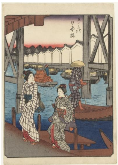
Fifty-three Stations "Nihonbashi"

The Fifty-three Stations is also known as Figure Tokaido from the way that the landscapes are in the background and the people, such as travellers and porters, as well as beautiful women, are given focus. This series was published by the printer Murataya Ichigoro around 1852, in the Kaei period. Normally, a series of Tokaido prints is 55 prints, including Edo and Kyoto as well as the 53 post-station towns, but this series has two Kyoto views for a total of 56 prints in chūban size.