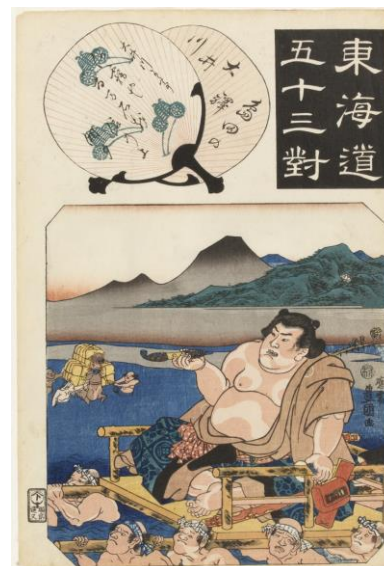
Utagawa Toyokuni III / Fifty-three Pairings for the Tokaido Road “Shimada Station: The Oi River”

Fifty-three Pairings for the Tokaido Road “Kawasaki”