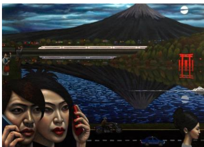
Tokaido Highway "Hakone" / © Carl Randall 2013

* The BP Travel Award is a general invitation exhibition which the National Portrait Gallery holds every year. The research expense of a work and the opportunity of an announcement are given to a winner. The National Portrait Gallery is an art museum that specifically collects a portrait works, and is an annex of the National Gallery of Art in London.