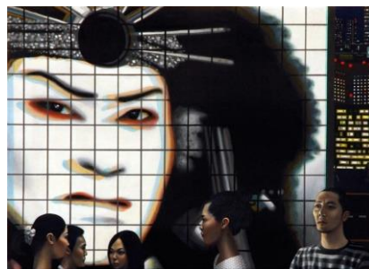
Tokaido Highway "Electric Tokyo" / © Carl Randall 2013