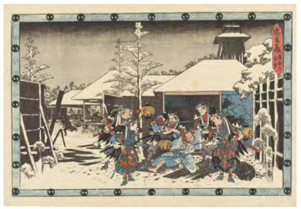
Parl2: Utagawa Hiroshige The Storehouse of Loyal Retainers "The Night Attack, Part 3: Achieving the Goal" Collection of Shizuoka City Tokaido Hiroshige Museum of Art