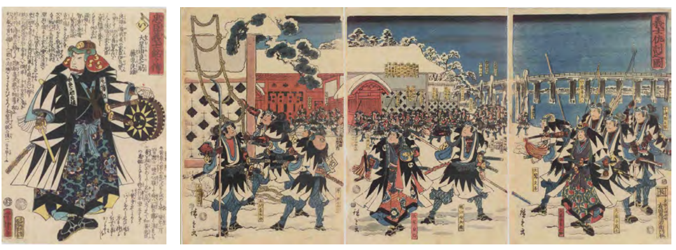
Part1: Utagawa Yoshitora The Story of the Faithful Samurai in The Storehouse of Loyal Retainers "The Syllable I: Öboshi Yuranosuke Fujiwara no Yoshio"

"Kanadehon Chūshingura (The Treasury of Loyal Retainers)," a play based on the Akō Incident that occurred during 1701 and 1703, was first performed in August, 1748. The feature was performed as a program of Ningyō Jōruri (Japanese puppet show) at the Takemoto-za theater of Dōtonbori. After receiving critical acclaim, the narrative was performed as Kabuki in January of the following year. In March of the same year, the feature was presented in Edo.