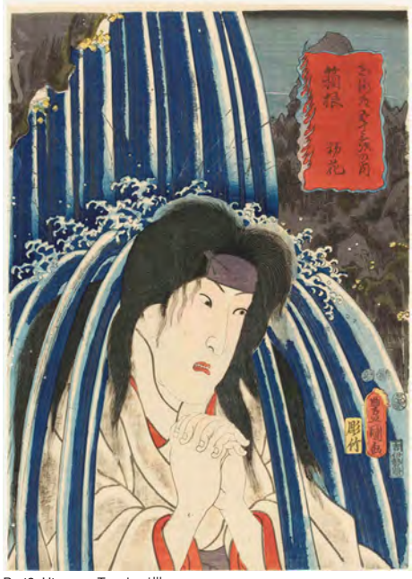
Part2: Utagawa Toyokuni III Fifty-three Stations of the Tökaidō Road "Hakone: Hatsuhana" Collection of Shizuoka City Tokaido Hiroshige Museum of Art

*Changes may be made to the exhibit content and displayed works.