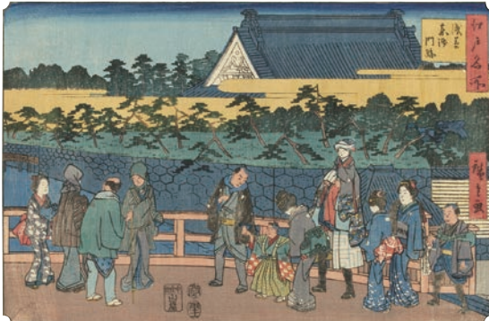
Part1 Utagawa Hiroshige Famous Places in Edo "Higashi Hongan Temple at Asakusa" Collection of Shizuoka City Tokaido Hiroshige Museum of Art