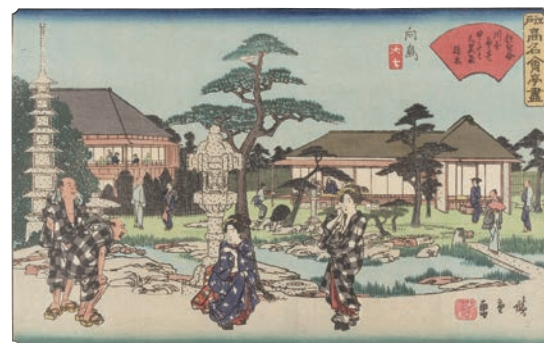
Part2 Utagawa Hiroshige Famous Restaurants in Edo "Mukojima: The Daishichi Restaurant" Collection of Shizuoka City Tokaido Hiroshige Museum of Art