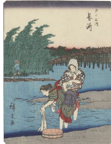
Part1 Utagawa Hiroshige Fifty-three Stations "Okazaki" Collection of Shizuoka City Tokaido Hiroshige Museum of Art