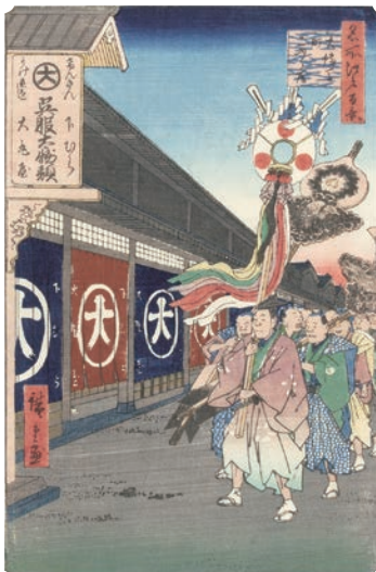
Part2 Utagawa Hiroshige One Hundred Famous Views of Edo "Silk-goods Lane in Ōdenma-cho" Collection of Shizuoka City Tokaido Hiroshige Museum of Art