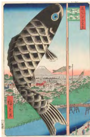
Part2: Utagawa Hiroshige One Hundred Famous Views of Edo "Suidōbashi Bridge and Surugadai" Museum Collection