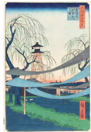
Part3: Utagawa Hiroshige One Hundred Famous Views of Edo "Hatsune no Baba Riding Grounds in Bakuro-cho" Museum Collection