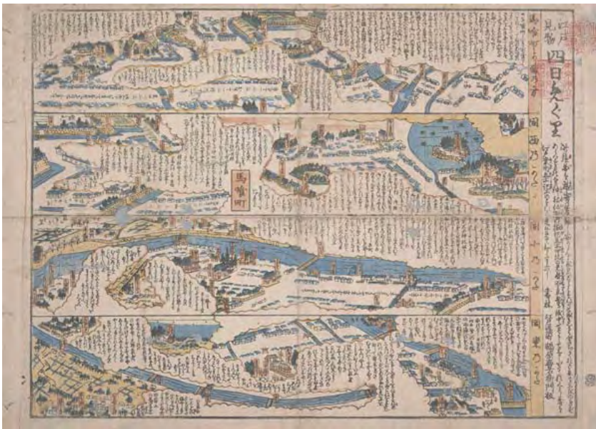
"Diagram for traveling around Edo in four days" Collection of Tokyo Metropolitan Library

The metropolis, Edo, was also a sightseeing city, and a tourist guidebook (magazine/guide) for those visiting Edo was published around the mid-17th century. This exhibition will be separated in four routes heading south, west, north, and east, as well as introducing Meisho-e by Hiroshige while referring to the guide map, " Diagram for Traveling Around Edo in Four Days " that introduce travel tips for efficiently making the best of four days while in Edo. Enjoy trips around Edo as if you were a traveler of the Edo era.