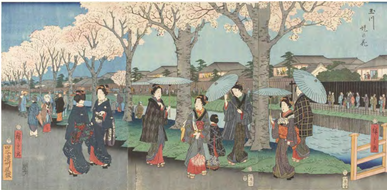
Part1: Utagawa Hiroshige "Cherry Blossom on the Tama River Embankment" Museum Collection

In these circumstances, it was only the areas before the barriers that could be traveled freely and accessed without travel permits. Suburbs in Edo that still had a lot of nature, as well as Enoshima, Kamakura, and Hakone Nanayū that were relatively accessible were popular spots to relax and enjoy for the people in Edo. Enjoy the many locations that were enjoyed by the Edo people in the form of Ukiyo-e.