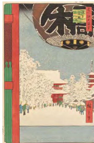
Part3: Utagawa Hiroshige One Hundred Famous Views of Edo "Kinryūzan Temple in Asakusa" Museum Collection