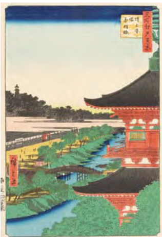
Part2: Utagawa Hiroshige One Hundred Famous Views of Edo "Zōjōji Pagoda and Akabane" Museum Collection