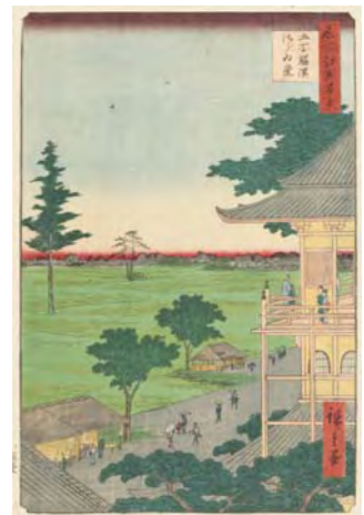
Part1: Utagawa Hiroshige One Hundred Famous Views of Edo "Spiral Hall, Five Hundred Rakan Temple" Museum Collection