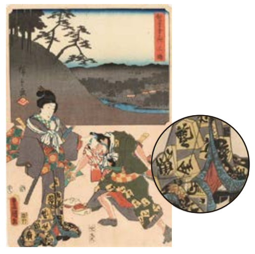
Part2: Utagawa Hiroshige, Utagawa Toyokuni III Fifty-three Stations by Two Brushes "Mishima" Shizuoka City Tokaido Hiroshige Museum of Art Collection

Patterns of people or household tools such as appliances/utensils