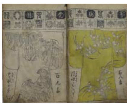
"Tokiwa Hinagata" Private Collection