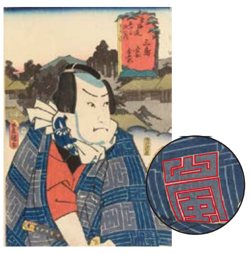
Part1: Utagawa Toyokuni III Fifty-three Stations of the Tōkaidō Road "Mishima: Kanaya Kingorō" Shizuoka City Tokaido Hirishige Museum of Art Collection