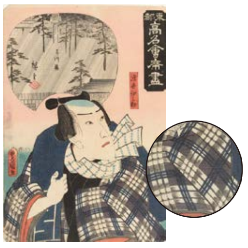
Part1: Utagawa Hiroshige, Utagawa Toyokuni III Famous Restaurants of the Eastern Capital "The Momokawarō Restaurant: Ukiyo Inosuke" Shizuoka City Tokaido Hiroshige Museum of Art Collection

Patterns that have overlapping or numerous circles, polygons, lines, and curves