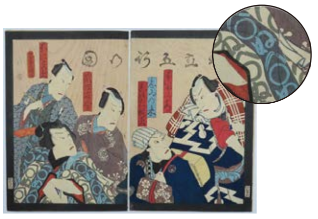
Part2: Utagawa Toyokuni III Roles Representing the Five Elements Shizuoka City Tokaido Hiroshige Museum of Art Collection

Patterns that have been produced by Kabuki actors or designs based on Kabuki outfits. A dyeing pattern that secretly incorporates actor names