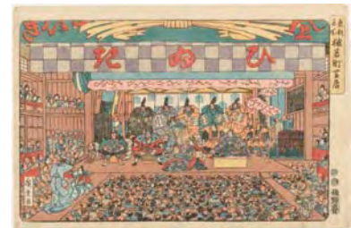
Part1: Utagawa Hiroshige Famous Places in the Eastern Capital "Theater in Saruwaka-machi" Shizuoka City Tokaido Hirishige Museum of Art Collection