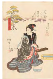
Part1: Utagawa Hiroshige Money Trees for Virtuous Women "Early Rising" Shizuoka City Tokaido Hirishige Museum of Art Collection