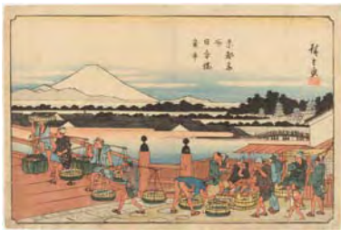
Part2: Utagawa Hiroshige Famous Places in the Eastern Capital "Fish Market at Nihonbashi Bridge" Shizuoka City Tokaido Hiroshige Museum of Art Collection

Street merchant selling products carried on a pole