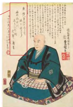
Part2: Utagawa Toyokuni III "Memorial Portrait of Utgawa Hiroshige" Shizuoka City Tokaido Hiroshige Museum of Art Collection