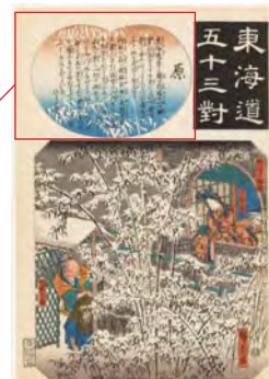
Part1: Utagawa Hiroshige Fifty-three Pairings for the Tōkaidō Road "Hara; The Take of the Bamboo Cutter" Shizuoka City Tokaido Hiroshige Museum of Art Collection