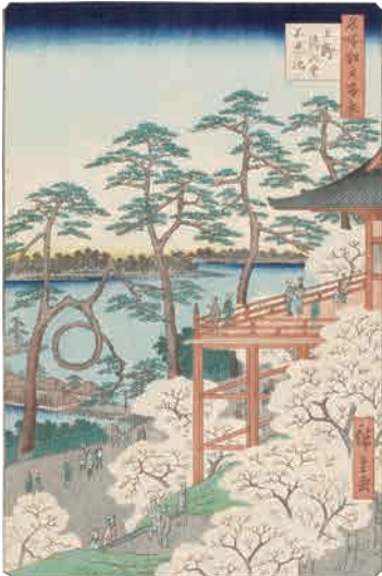
Part2 Utagawa Hiroshige One Hundred Famous Views of Edo "Kiyomizu Hall and Shinobazu Pond at Ueno" Collection of Shizuoka City Tokaido Hiroshige Museum of Art