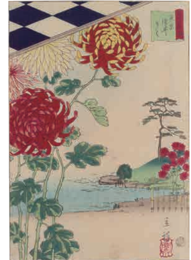
Part2 Rissho (Utagawa Hiroshige II) Thirty-six Selected Flowers "Chrysanthemums at Somei in Tokyo" Collection of Shizuoka Prefectural Central Library