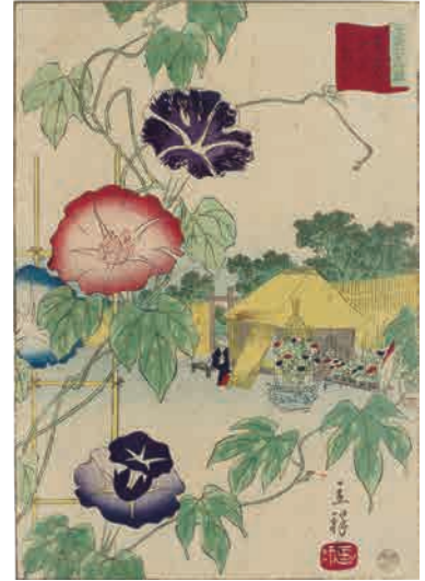
Part1 Rissho (Utagawa Hiroshige II) Thirty-six Selected Flowers "Morning Glories at Iriya in the Eastern Capital" Collection of Shizuoka Prefectural Central Library