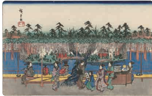
Part1 Utagawa Hiroshige Famous Places in the Eastern Capital "Wisteria at Kameido" Collection of Shizuoka City Tokaido Hiroshige Museum of Art