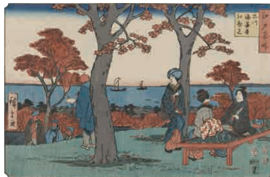
Part2 Utagawa Hiroshige Famous Places in Edo "Maple-leaf Viewing at Kaian Temple in Shinagawa" Collection of Shizuoka City Tokaido Hiroshige Museum of Art