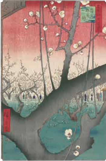
Part1 Utagawa Hiroshige One Hundred Famous Views of Edo "Plum Garden in Kameido" Collection of Shizuoka City Tokaido Hiroshige Museum of Art