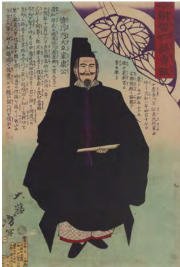
Taiso Yoshitoshi (Tsukioka Yoshitoshi) Mirror of wisdom and humanity of heroes of Japan "Tokugawa Ieyasu" Collection of Shizuoka Prefecture Central Library

Including the years that Ieyasu was a hostage of the Imagawa, Ieyasu spent 1/3 of his life in Shizuoka; therefore, there are many historical sites related to Ieyasu in the area. This exhibition will introduce documents related to Ieyasu that remain in temples and shrines of Shizuoka along with his footsteps.