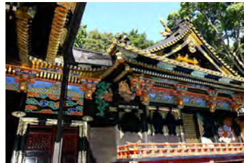
Kunozan Toshogu Shrine