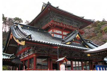
Shizuoka Sengen Shrine