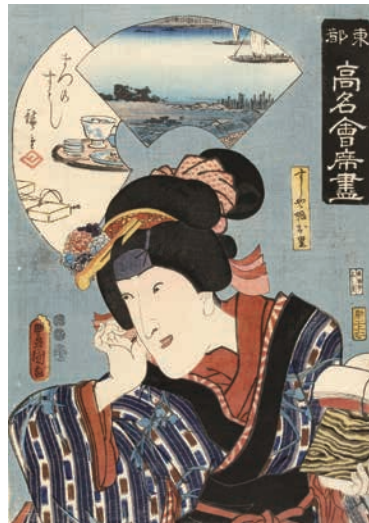
Part2 Utagawa Hiroshige, Utagawa Toyokuni III Famous Restaurants of the Eastern Capital "The Matsunosushi Restaurant: Osato" Collection of Shizuoka City Tokaido Hiroshige Museum of Art