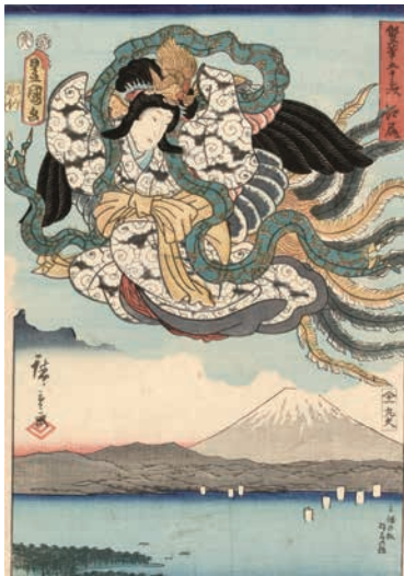
Part1 Utagawa Hiroshige, Utagawa Toyokuni III Fifty-three Stations by Two Brushes "Ejiri: The Pine Tree of the Feather Robe at Miho no Matsubara" Collection of Shizuoka City Tokaido Hiroshige Museum of Art