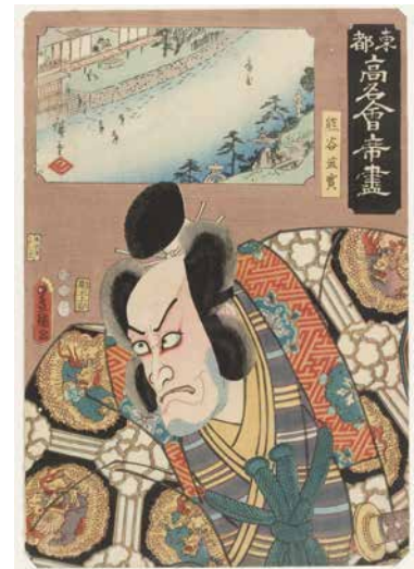
Part2 Utagawa Hiroshige, Utagawa Toyokuni III Famous Restaurants of the Eastern Capital "The Ogiya Restaurant: Kumagai Naozane" Collection of Shizuoka City Tokaido Hiroshige Museum of Art