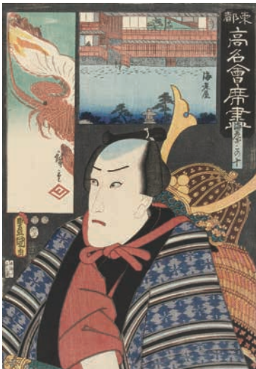
Part2 Utagawa Hiroshige, Utagawa Toyokuni III Famous Restaurants of the Eastern Capital "The Ebiya Restaurant: Ebizako no ju" Collection of Shizuoka City Tokaido Hiroshige Museum of Art