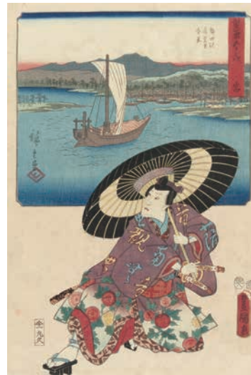
Part1 Utagawa Hiroshige, Utagawa Toyokuni III Fifty-three Stations by Two Brushes "Miya: Distant View of Atsuta Station and Nezame Village" Collection of Shizuoka City Tokaido Hiroshige Museum of Art