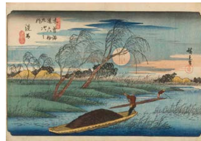
Utagawa Hiroshige Sixty-nine Stations of the Kisokaidō "Seba" Collection of Museum