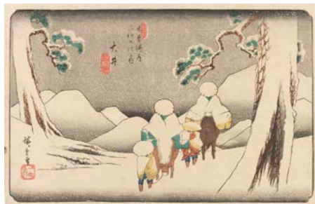
Utagawa Hiroshige Sixty-nine Stations of the Kisokaidō "Ōi" Collection of Museum