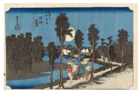
Utagawa Hiroshige Fifty-Three Stations of the Tōkaidō "Numazu: Twilight" Collection of Museum