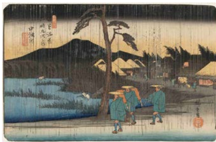
Utagawa Hiroshige Sixty-nine Stations of the Kisokaidō "Nakatsugawa on a Rainy Day" Collection of Museum