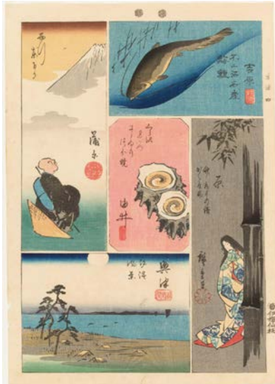
Utagawa Hiroshige Cutout Pictures of the Tōkaidō Road "No. 4: Hara, Yoshiwara, Kanbara, Yui, Okitsu" Museum Collection