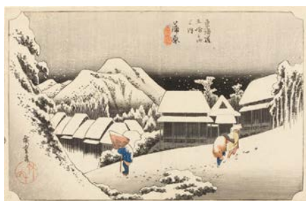
Utagawa Hiroshige Fifty-Three Stations of the Tōkaidō "Kambara: Night Snow" Collection of Museum